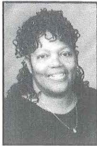
Johnnie Greene Family Service Centers