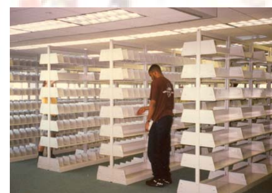
Campus Archives, Poynter Library