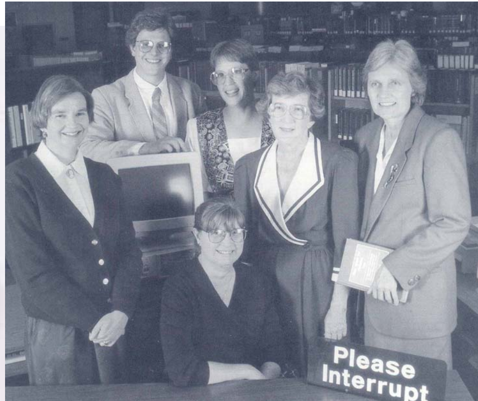
Campus Archives, Poynter Library