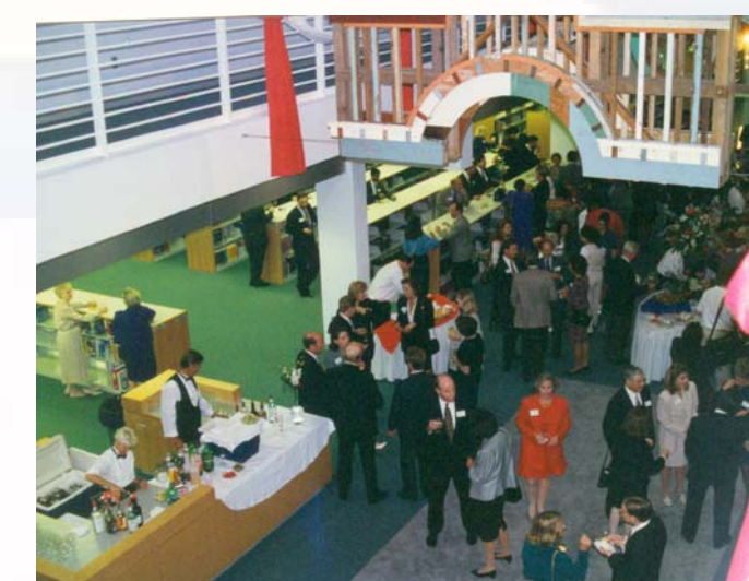
Campus Archives, Poynter Library