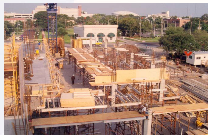
Campus Archives, Poynter Library