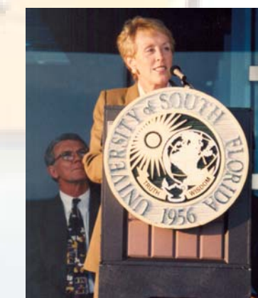
Campus Archives, Poynter Library