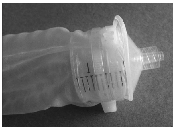
Fig. 3: Condom attached to a 60-mL syringe tip as used to collect seepage passing through the sampler.

Given that the samplers do not impede flow of water from the wall of the cave into the cave opening, rather they merely channel the flow through the needle hubs, the samplers can be used to determine specific discharge from the walls into the cave (i.e., seepage). The general approach employed here was developed in the late 1970s (Lee 1977; Lock & John, 1978) and has been used in lakes, sandy-bottomed streams, and estuarine and coastal locations to measure in-seepage (Flewelling et al. 2012; Holly et al. 2003). To collect the water passing through the needle hubs, a 60-mL syringe was cut to obtain a section of the syringe barrel about 3.5 cm long, including the male Luer-lock tip. A latex condom was then placed over the larger end of the syringe tip and secured in place with two short nylon cable ties placed around the unit such that the clasps were on opposite sides of the barrel of the syringe tip (Fig. 3). The use of two cable ties is essential to obtain a good seal of the condom to the syringe barrel. Use of several different chemical sealants