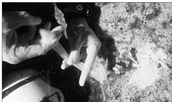
Fig. 4: Deployed sampler fitted with condom attachment for measurement of discharge of groundwater across the face of the cave wall.

always resulted in disintegration of the condom where it contacted the sealant material. A stopcock (Cole Parmer, YO-30600-25) was attached to the syringe tip, the air expelled from the condom and the stopcock closed, and the apparatus taken to the sampler location by a diver. The unit was attached to the short-needle hub in the sampler. A stopcock was also placed on the long-needle hub and closed to prevent water from passing through that opening (Fig. 4).