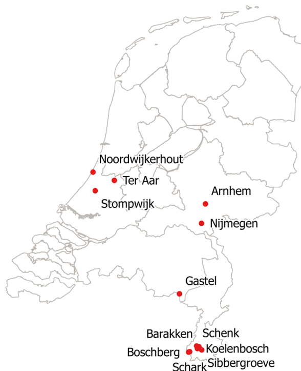
Fig 1. Catching sites of Campylobacter -positive bats in the Netherlands.

https://doi.org/10.1371/journal.pone.0190647.g001