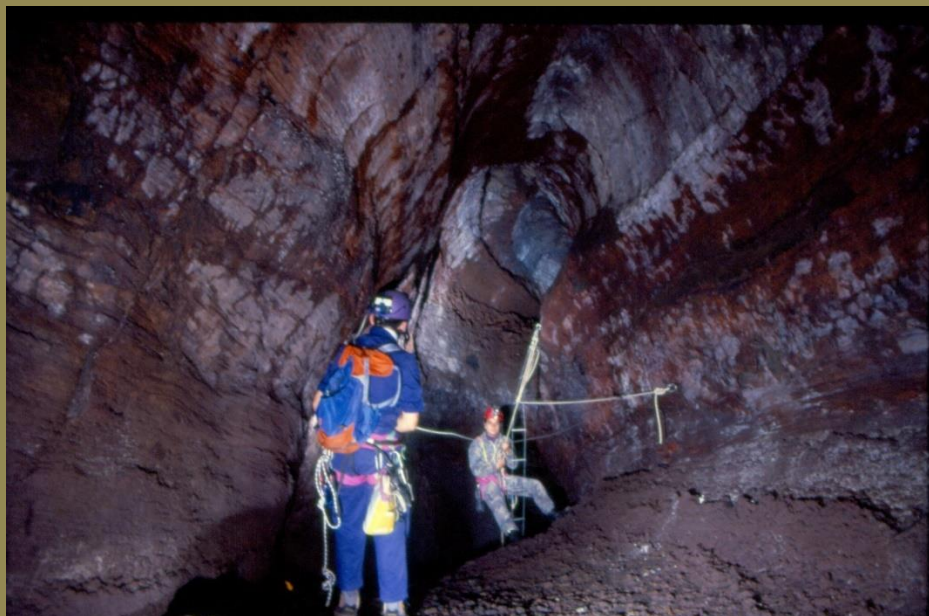
Figure 2: Tre Livelli Cave, from first level to the second

The search for a continuation downstream of the lava tube of the Grotta dei Tre Livelli led to the discovery, in 1995, of the KTM cave.