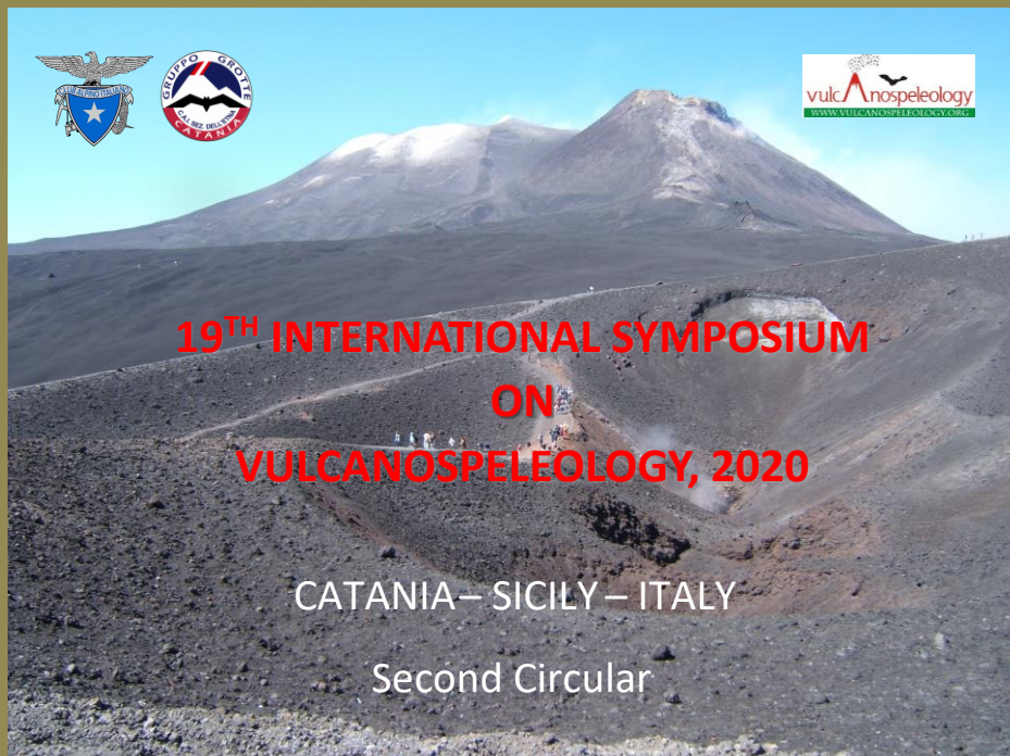
Etna's summit craters seen from Barbagallo craters