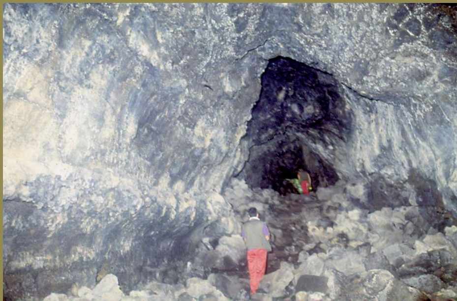
Figure 6: Burrò Cave

part of the cavity a large lamina detached from one of the walls and, leaning against the opposite side, produced some sort of elevated room. About 30 meters further down, a rock pillar separates the tunnel into 2 small parallel tunnels. The cave has a large colony of bats of different species.