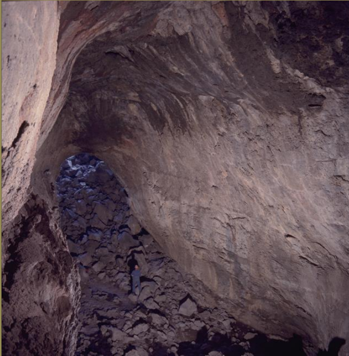
Figure 10: Catanese I

The second cave consists of a single tunnel just over 20 m long. You enter by descending on a chaotic mass of collapsed blocks. The floor, after the first section, appears flat with beaten earth and stones; towards the bottom it is possible to observe lava with a joint surface. On the walls there are numerous sheets of lava of different thickness and folded in various ways. The section of the cave has a characteristic pointed arch shape, but not symmetrical as is normally observed in other cavities. The southwest wall is overhanging while the northeast is an inclined plane on which it is easy to climb.