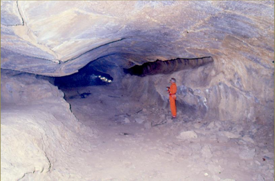
Figure 7: Micio Conti Cave

These caves are lava flow tunnels dating back to the famous eruption of 1669 that destroyed many small villages and reached the town of Catania. The entrances of the caves are skylight windows caused by collapses of the lava tube vault. Inside both cavities it is possible to observe flow linings and re-melting stalactites.