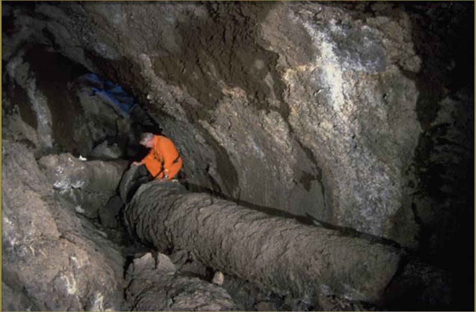
Figure 10: Catanese II, a lava roll

Catania was founded in the 8th century BC by Chalcidians, a Greek population coming from Thrace. In 1434, the first university in Sicily was founded in the city. In the 14th century and into the Renaissance period, Catania was one of Italy's most important cultural, artistic and political centres.