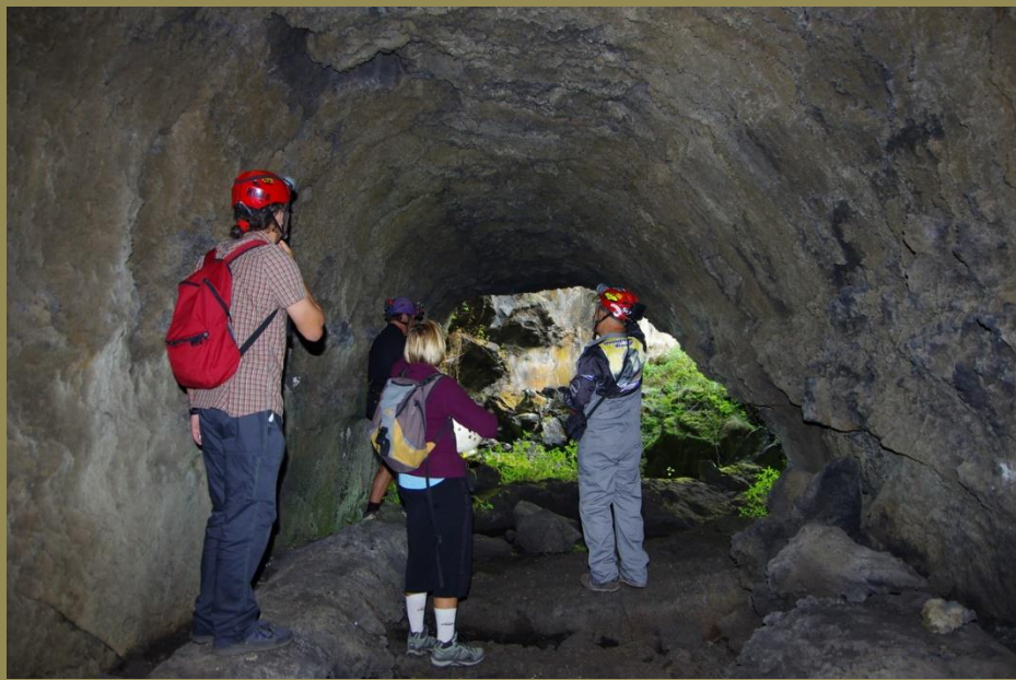
Figure 5: Intralio Cave, the biggest lava tube

The Gallo Bianco caves are located in the township of Adrano. To reach them, you have to walk up a long lava canyon until you reach an impressive lava arch, which is what remains of a large collapsed lava tube. Further on, along the canyon, two lava tubes can be seen. These are lava flow caves, 60 meters long, with a marked slope. Both end after a narrow passage that brings to a slightly larger hall.