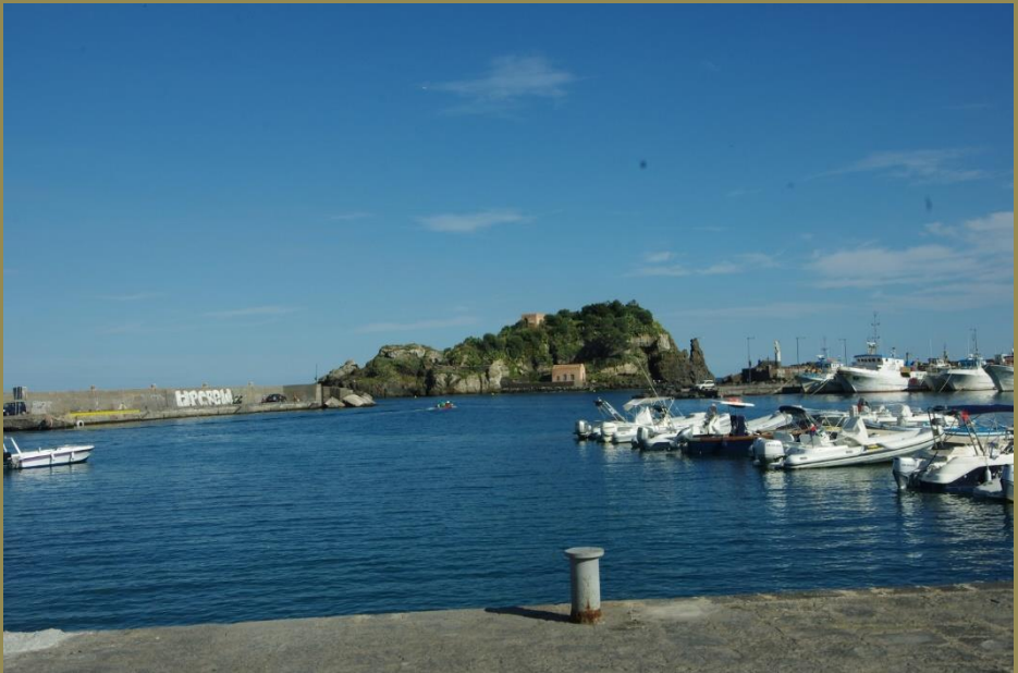
Figure 11: Acitrezza port, in background the Lachea island