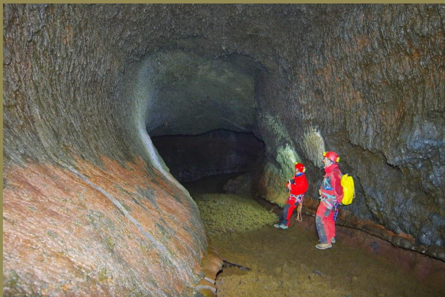
Figure 1: KTM Cave c) GROTTA DELLE PALOMBE

A pit 8 m deep gives access to a first room of the size of 5 m by 15. At the bottom of this room there is a 3 m deep well that leads to a 15 m long steep slope that ends in a smaller room than the previous above a 17 m deep well. From the base of this pit you can follow the eruptive fracture for about 60 m southwards. This is well preserved in some sections and has a uniform glazed lining on the walls, formed during the eruption. Elsewhere the walls of the fracture collapsed and the material behind them collapsed inside the cavity in chaotic masses of large blocks or in heaps of small stones. Following these phenomena, the cavity has several enlargements. Continue through a passage located 6 m high, reachable by a ladder that can be fixed to a rocky outcrop. This opening leads to a section of the cavity where the walls are intact and a couple of metres apart. A little further on we note a collapse of the western wall. The consequence of the collapse is the formation of a room at a higher level.