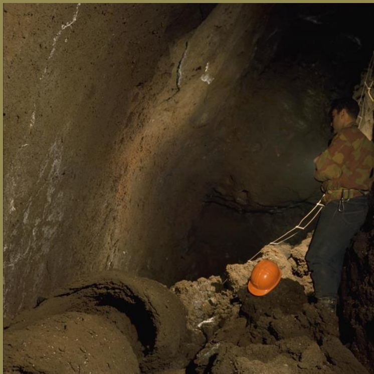
Figure 4: Palombe Cave, a lava roll

To reach the front of the collapsed material requires climbing a jump of 6 m on unstable blocks. From the room, a steep slope of loose material can be followed for 25 m. Subsequently, it is still possible to follow the fracture for 75 m, which is again intact and gradually shrinking until it becomes blocked. The floor here is made up of lava with a fragmented scoriaceous surface. In the terminal part of the cave the eruptive fracture is on two different levels. In the lower one there are at some points accumulations of fine volcanic sand; it is also possible to observe curled sheets of lava with the formation of rolls. In many places, slabs have detached from the walls and clutter the passage.