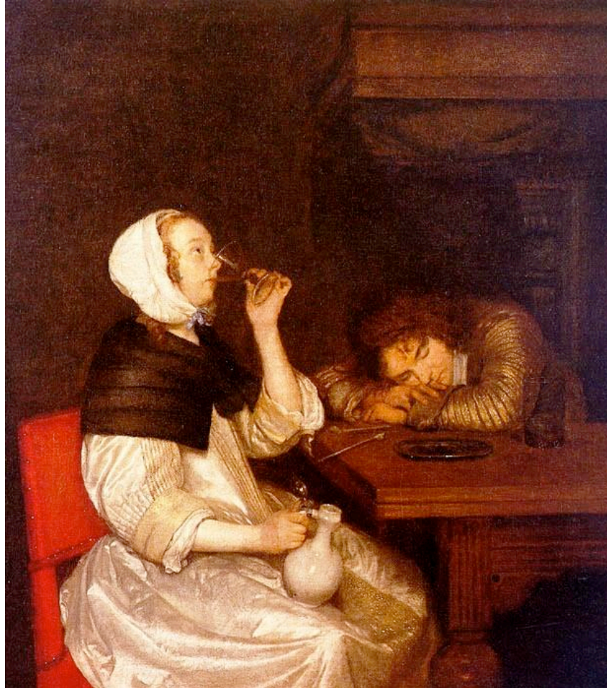
Figure 8. Gerard ter Borch, Woman Drinking with a Sleeping Soldier .

The consumption of alcohol and tobacco was equally risky to individuals struggling for power in the social arena. Unemployed mercenaries, for example, found ways to express their masculinity outside of the battlefield. This was often attained through drinking competitions and fraternizing. This particular soldier's defeat, however, comes not in battle or from a brutish enemy, but at the dinner table and from a female maiden who continues drinking while he sleeps. Her untrustworthiness is associated with the Prodigal Son theme that categorized females with agency as procuresses, whores, or thieves; while a woman who obeys her role as a chaste housewife is perpetually regarded as meek and vulnerable. The Prodigal Son theme was also