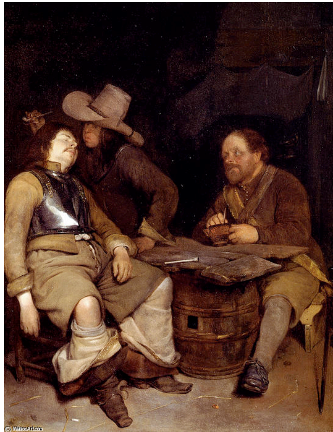
Figure 7. Gerard ter Borch Guard Room with a Sleeping Soldier (1652-1653).

contemplative female, with a dishonorable masculine figure. As such, the soldier serves as a mockery of Orangist patriotism. He is ironically prone and undoubtedly feminized. The three men occupying the canvas are a far cry from the idealized Scipionic image with which the Orangists aligned themselves.