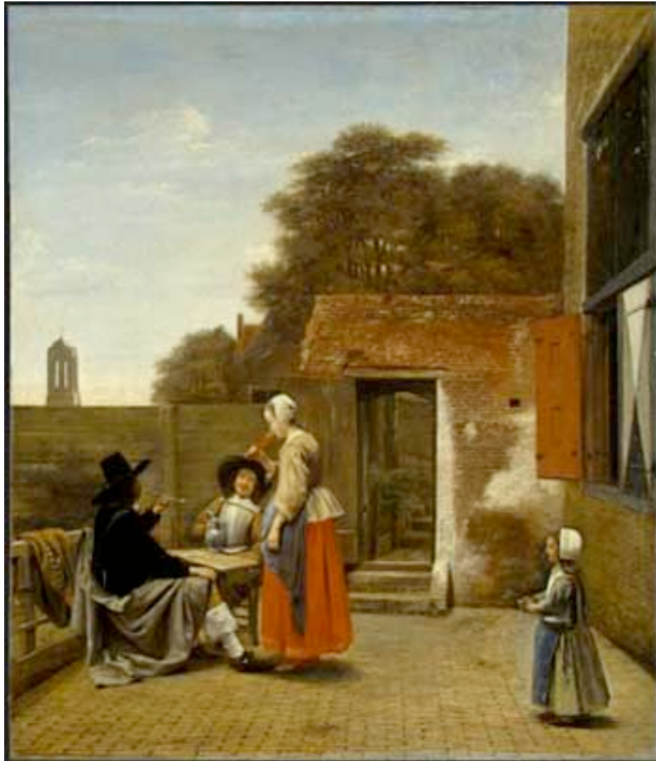
Figure 2. Pieter de Hooch. A Dutch Courtyard (1658-1660).

A close-up of the soldiers and maiden reinforce the metaphors of domestic and foreign spaces. The soldiers drink from a westerwald jug, named from that area of Germany in which they were made. And they smoke tobacco that was presumably imported from America. The female drinks from a pasglas (measuring glass), implying that she is well on her way towards intoxication. The pasglas was marked like a measuring cup and was used by the Dutch for drinking games since the Middle Ages. It was typically “passed from one player to the next, who