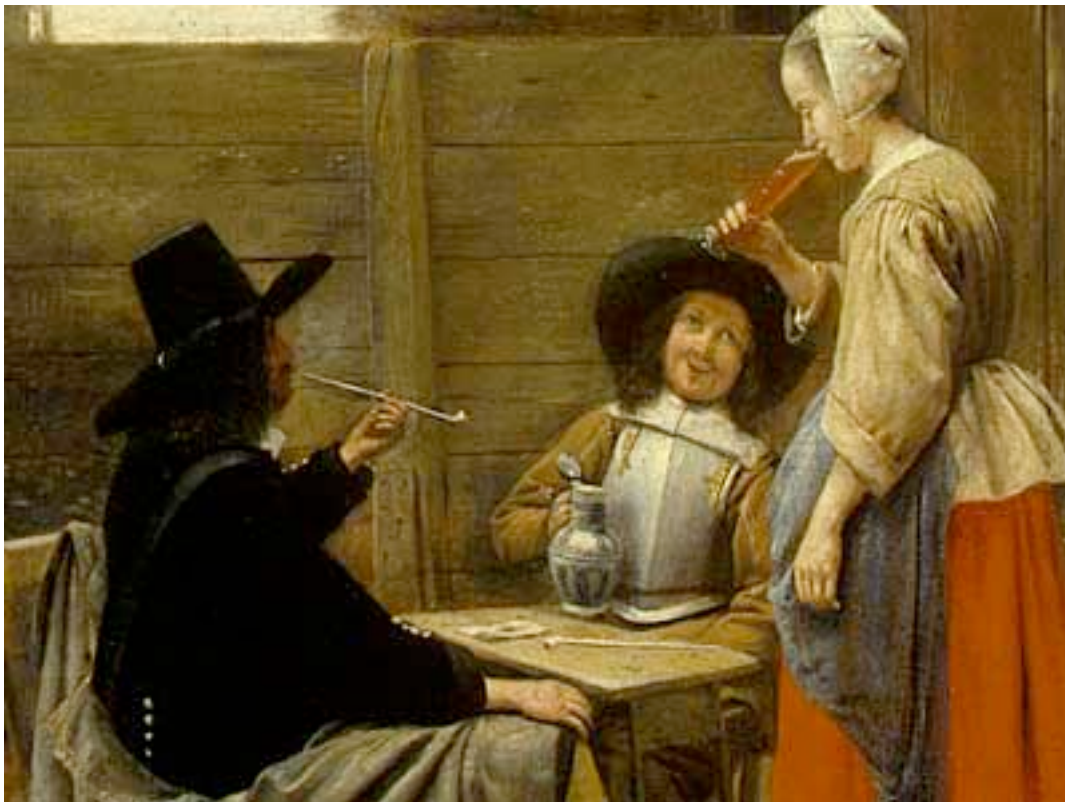
Figure 3. Pieter de Hooch. A Dutch Courtyard (1658-1660).

was challenged to drink to the next level. If the player failed to drink exactly to that mark, he or she would have to drink to the next.” 41 The imagery is consistent with the stereotypes of maidservants, which suggested that they were prone to gossip, troublemaking, strong drink, smoke, and unbridled sexuality. These themes are reinforced by the soldier’s unfastened breeches, phallic pipe and the direction in which the pipe is aimed.