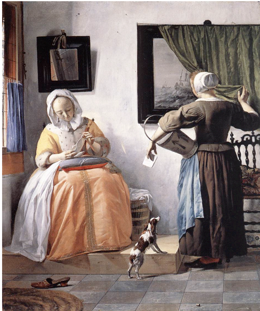
Figure 4. Gabriël Metsu Woman Reading a Letter (1665).

an affinity to him. The stormy seas in the embedded painting speak of the dangers associated with maritime travel but also with the storms of passion. The woman reading tilts her letter towards the window but it is not entirely clear if she is doing this for light or to shield the contents of the letter from the other female.