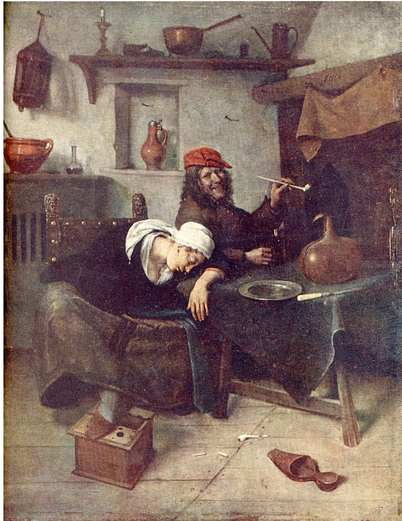
Figure 6. Jan Steen The Idlers (1660).

sleeping female's legs spread above an apparent peephole on the box supporting her feet add to the sexual suggestiveness of the scene.