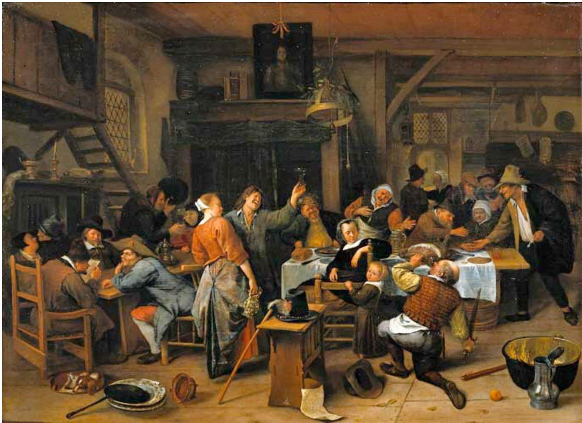
Figure 10. Jan Steen, Prinsjedag (1660s).

The Orangists promoted a strong central government and were closely aligned with the Dutch Reformed Church, but they differed sharply with the Republicans who promoted more autonomy and power at the state's level. Jan Steen, who has placed himself in the center of the painting, was anything but a devout Calvinist. On the contrary, he was a Catholic, probably more so in name than in practice, but more to the point, he was a self-described drinker and womanizer. His presence in this scene can only be understood as comic relief. Additionally, Steen has intertwined so much patriotic and moral symbolism with feasting and drinking that he is obviously being ironic. Along these lines, Simon Schama argues that heavy drinking and