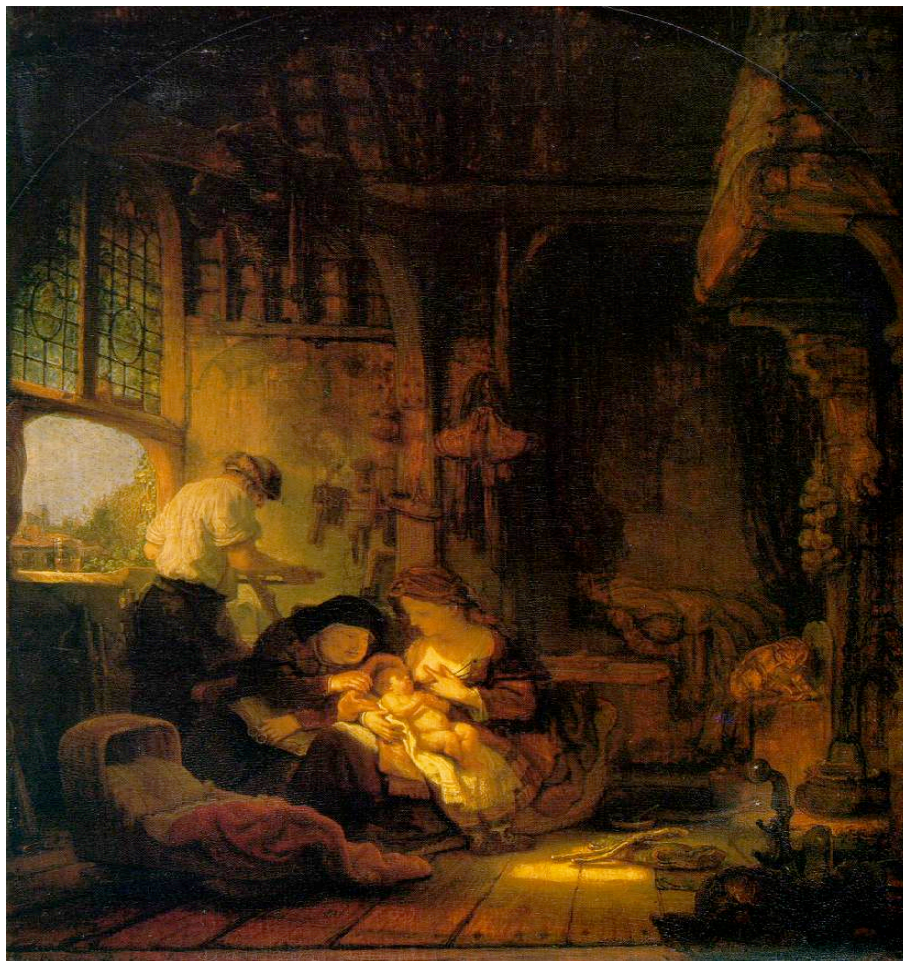
Figure 1. Rembrandt van Rijn The Holy Family (1640).

very substance of her body.” 33 For women, this gender assignment was of the utmost importance. The nursing mother was the ultimate symbol of domesticity and virtue. She represented “domestic harmony and moreover stood for Dutch society at large, serving as an emblem of good government.” 34 Nanette Salomon argues that political and domestic spaces were not mutually exclusive, and Luther and Calvin expressed similar views suggesting that the governing of the family was a “microcosm of the state and its government.” 35