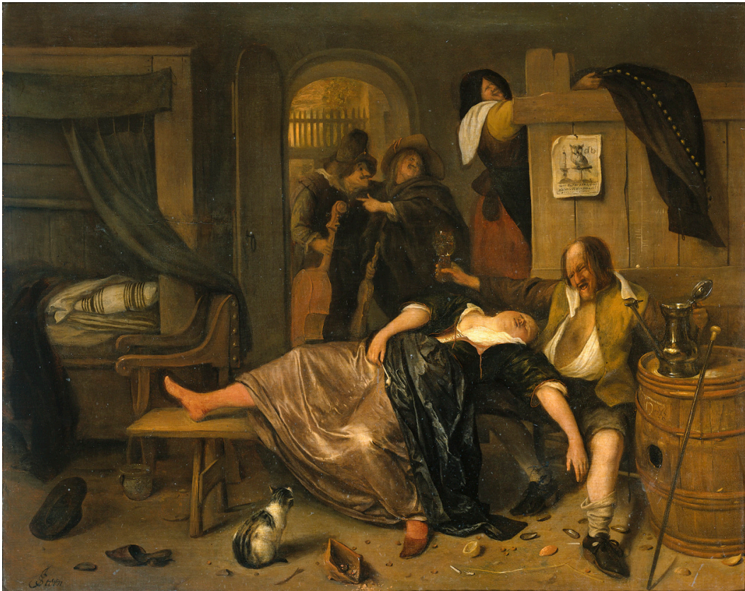
Figure 11. Jan Steen, The Drunken Couple (1655-65).

smoking could be linked to concerns of the state “in terms of betrayal” 94 - a symbolic act of treason byway of one’s noncompliance to their prescribed gender-based responsibilities.