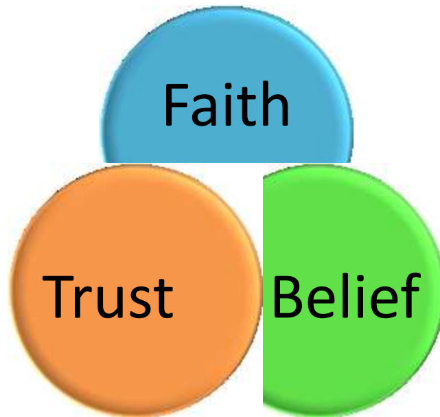
Figure 1. Interconnected sub-themes for trials and hardships

When participants in this study shared stories about trials and hardships all of them described experiences that represented a unified theme of belief, faith, and trust in God. Participants shared a number of difficult life events including the loss of parents, children, first loves, and spouses. Also many experienced a sudden onset of a challenging medical condition (e.g., cancer, aneurysms, deafness, polio, etc.) or had a loved one with a serious medical condition (Alzheimer's, diabetes, cardiac arrests) during their lifetime. For instance, when asked to describe what God has taught her about trials and hardships during her lifetime, a 77-year-old female participant (in remission from cancer) shared the following insightful narrative: