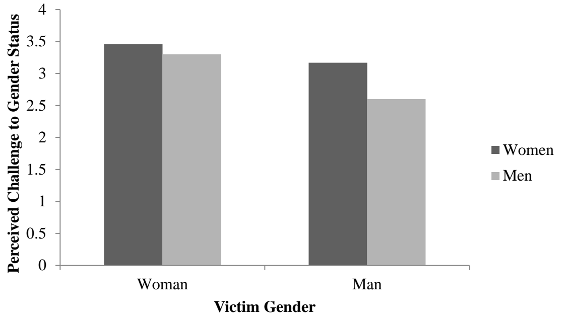
Figure 3. Perceived challenge to gender status by victim gender and participant gender.