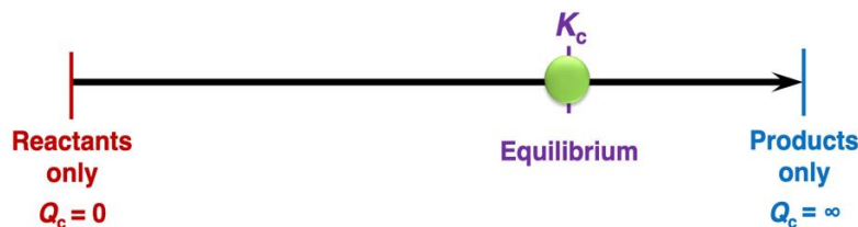
Figure 2. Representation of K_c and Q_c

Originally, equation (7) shows \text{HPO}_4^{2-} on the reactants side where only one mole of hydrogen phosphate is required to make one mole of algae. The leak from the reservoir has increased the mole concentration of hydrogen phosphate to \approx 15752.7 moles per hour as calculated in equation (6). To compensate for the drastic increase in hydrogen phosphate, the reaction direction is going to shift towards the products side, or the right when looking at Figure 2. This shift will lead to an increase in algae production in order to use up the \text{HPO}_4^{2-} and get back to equilibrium leading to a possible red tide. If a red tide were to occur the fish populations and marine plant life populations would drop. The beaches near Tampa Bay would also close which would lead to a decrease in tourism. Overall, the significant increase in moles of \text{HPO}_4^{2-} per hour could be detrimental to Tampa Bay's economy as well as its marine ecosystem if a large algae bloom resulting in red tide were to occur.