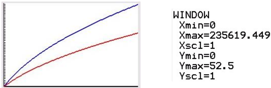
Figure 2: Comparison of a rocket trajectory on a gravitational turn with the assumption of constant gravity (blue) versus inverse square distance gravity (red).

We can check the results of our numerical approximations by plotting the integrals as time functions of position like so: