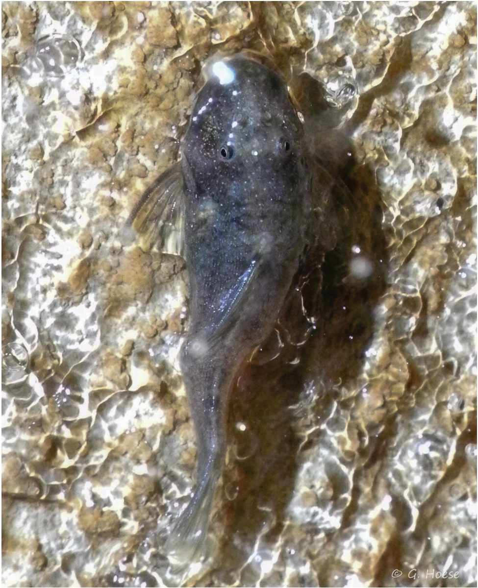
Figure 2. Chaetostoma microps in situ on flowstone wall in sheet flow. Note that the fish is facing up. The slope at this location is estimated to be approximately 75 degrees.

more algivorous (Lujan et al. 2012) it seems unlikely that they inhabit the caves for extensive periods. However, flowstone features and rocks in cave streams may host microbial films that could be grazed, providing some nutrition.