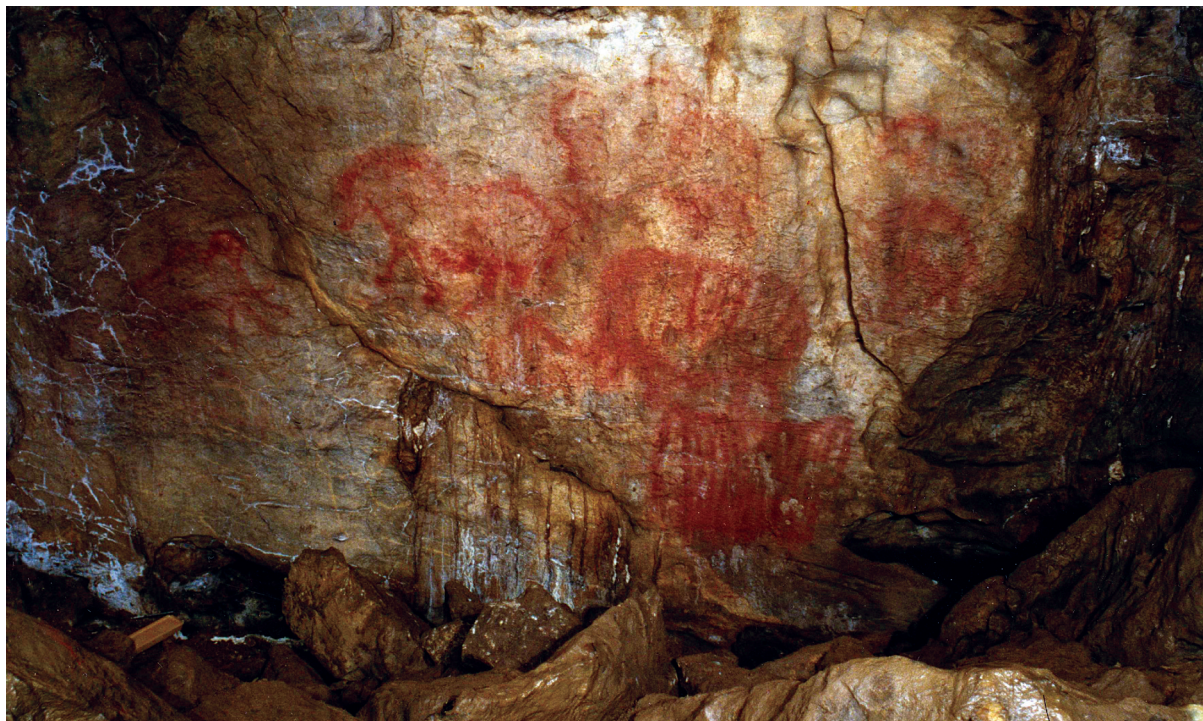
Figure 1. Main panel in the Paintings Hall, Kapova cave (Ural). On the ground level under the panel, at the left and right of the engraved horse, we can see two very resonant niches in which ‘bison effects’ are easily obtained.

male voice on, for example, a register between D_1 - C_3 around 74 to 250 Hz), for a short duration of about half a second. From 0 to 1 echo, the resonance is insignificant, and for 2, 3–4, 5–6, and 7–8 echoes, the resonance is respectively weak, good, very good, and exceptional. In the caves of Arcy-sur-Cure (Burgundy), Niaux (Ariège), and Kapova (Ural), such exceptional resonances correspond to the most exceptional sets of paintings in the caves. To illustrate the relevance of this graduation, we give two simplified schemas of the relationship between the number of echoes and the concentration of paintings in the caves of Arcy and Kapova ( Table 1 ) where the number of paintings is proportional to the number of echoes.