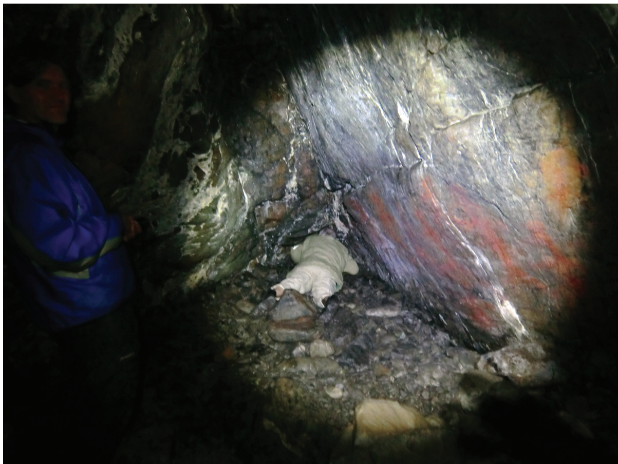
Figure 2. Solsemhula cave in Norway. The procession of painted humans on the right wall is walking towards the recess at the bottom of the cave; in this recess, it is easy to obtain 'bison effects'.

for what we call bison or other animal effect (see Fig. 2 ). This conjunction of a large painting pointing to a very resonant recess is unique and very impressive. We plan to study other painted caves on the north coast of Norway.