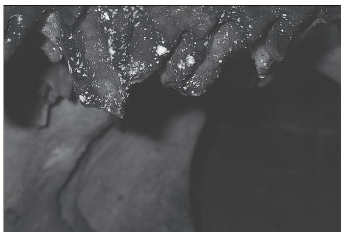
Fig. 1. Pseudonocardia sp. colonies in stalactites (Doña Trinidad Cave, Ardales, Spain).

Table 1 shows the new species of actinobacteria isolated from subterranean environments reported since 2000, as gathered in the International Journal of Systematic and Evolutionary Microbiology. The identification of new species of the genera Agromyces , Amycolatopsis , and Kribbella (Figure 2) indicates that these environments constitute an ecological niche with a solid potential for the study of biodiversity. The conditions of high salinity in certain niches, and the stability of the microbial communities over the years, make these habitats of great interest and a target for in-depth study, to obtain an understanding not only of the processes forming natural microbial communities and of their role in the interaction with minerals, but