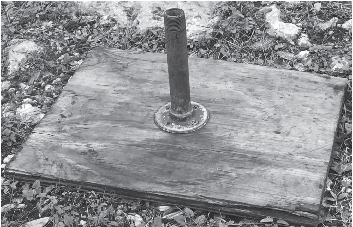
Figure 1. A base constructed from plywood, a flange, and metal pipe nipple for supporting a net pole.

Two bases, two connectors, and four pole sections are needed for setting up one net. Erecting a net can be accomplished quickly. Once a lane is prepared by trimming vegetation and any needed rocks are gathered, I can set up or take down a net by myself