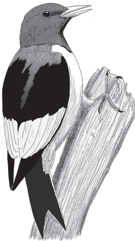
Red-headed woodpecker Comstock studios (George West)