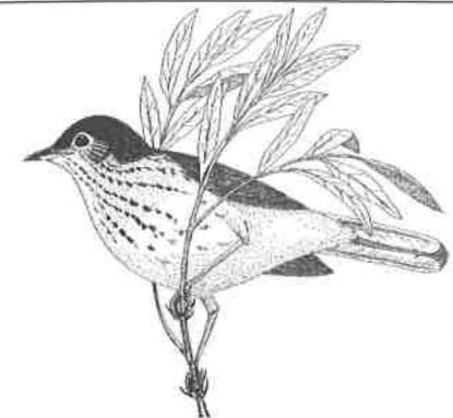
Swainson's Thrush by George West