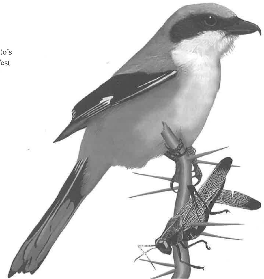
Loggerhead Shrike from Birchside