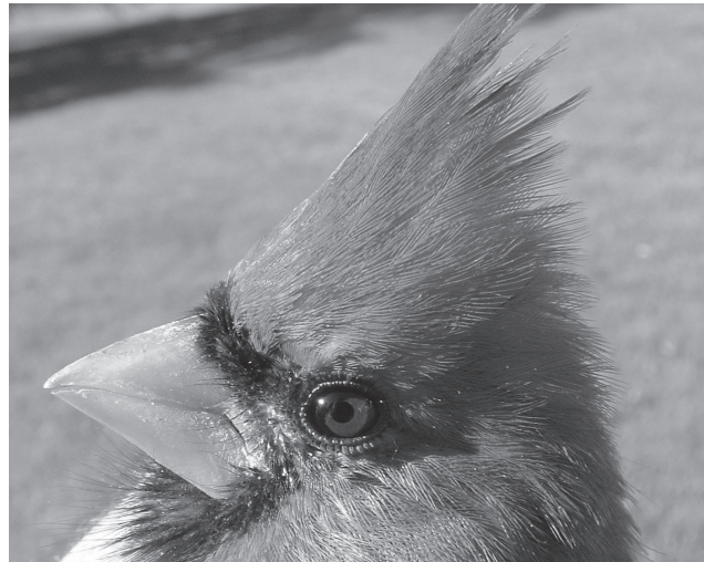
Northern Cardinal

Of course, many thanks to the compilers of these seasonal station reports. It was a pleasure to note the number of visitors welcomed to the various sites – especially interested college students.