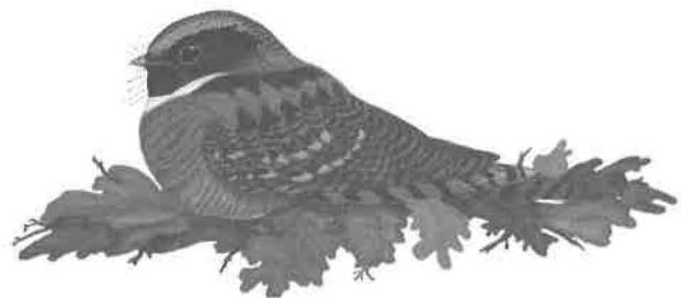
Eastern Whip-poor-will by George West