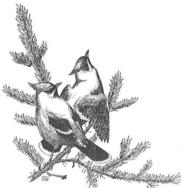
Bohemian Waxwings