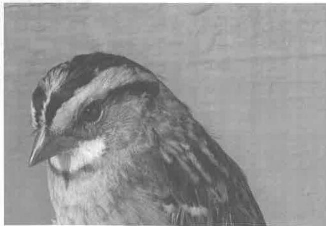
White-throated Sparrow

7429 E. Fouch Rd. Traverse City, MI 49684