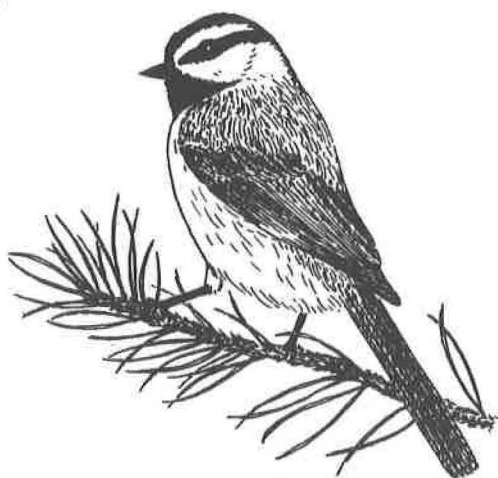
Mountain Chickadee