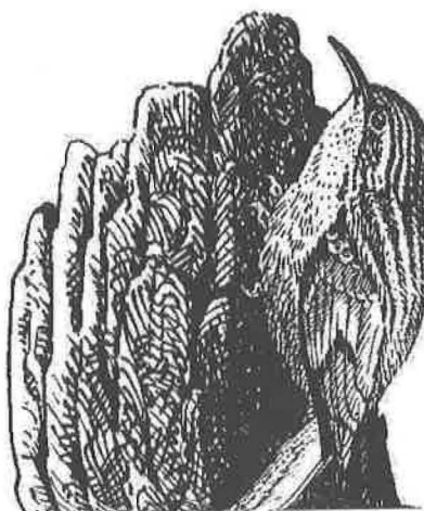
Brown Creeper