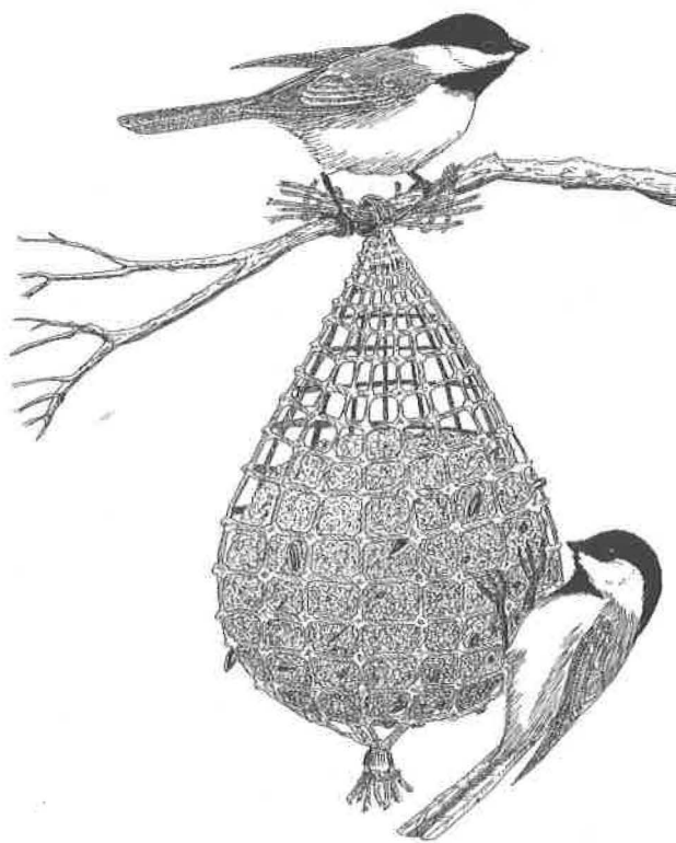
Black-capped chickadees by George West