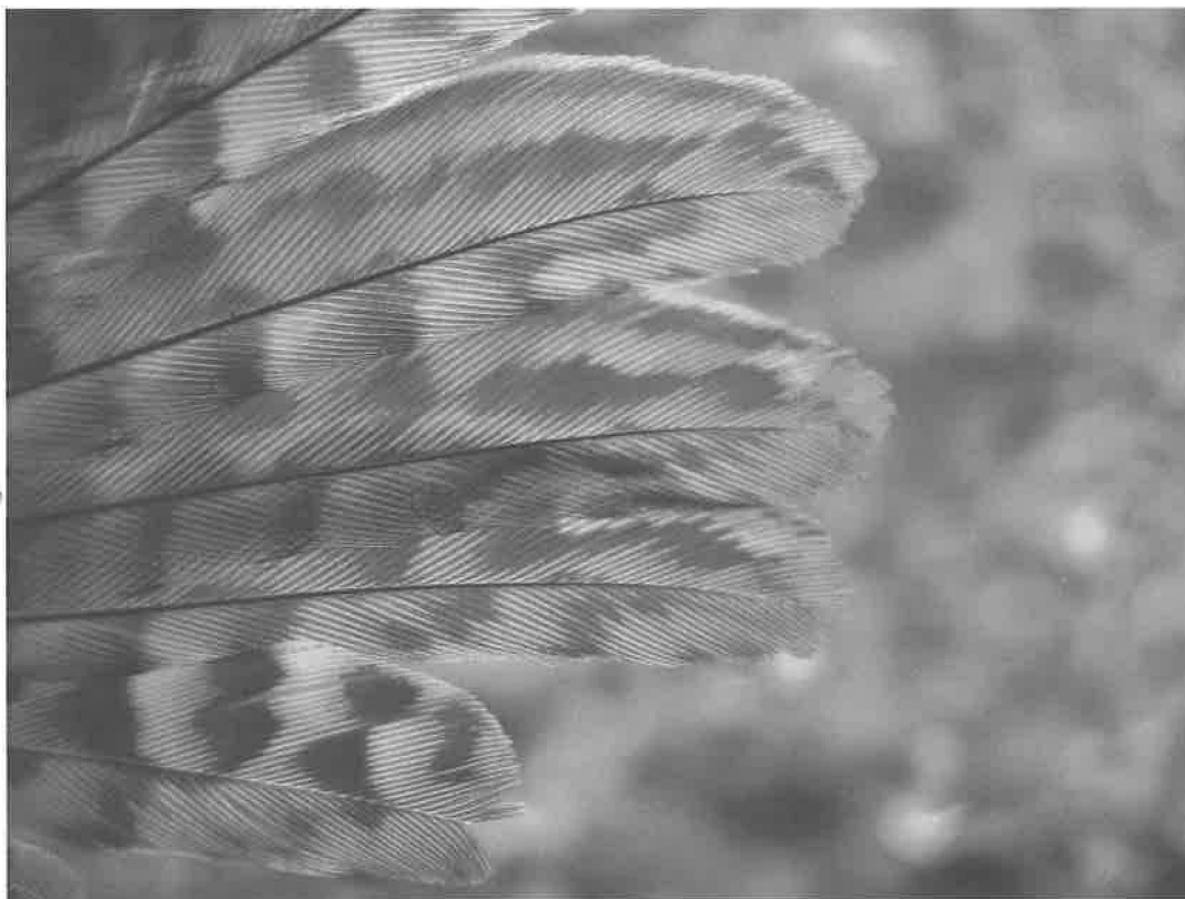
C) Spot-breasted Wren: molt limits between rectrices.