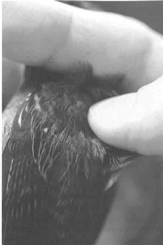
D) White-breasted Wood-Wren: the second outermost greater covert is formative.