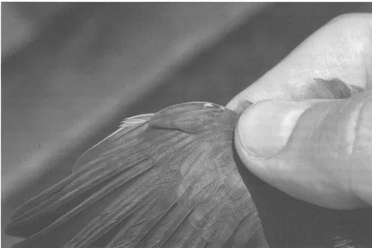
A) Spot-breasted Wren: molt limits are between the greater coverts 2-3 and the lesser and median ulula.

Fig. 2 A-E. The formative plumage of these two wrens is essentially composed by juvenal remiges and rectices, formative body feathers, and a mixture of formative and juvenal wing coverts. Formative feathers are indistinguishable from definitive ones. In both species, bars of juvenal feathers are blackish, not black, and ill-defined. These differences render molt limits relatively easy to detect. Provided that these species apparently have a single breeding season, their prealternate molts, if present, are limited to body feathers and their definitive basic molt is complete. The presence of molt limits within the wing feather tracts allows identifying first-cycle individuals.