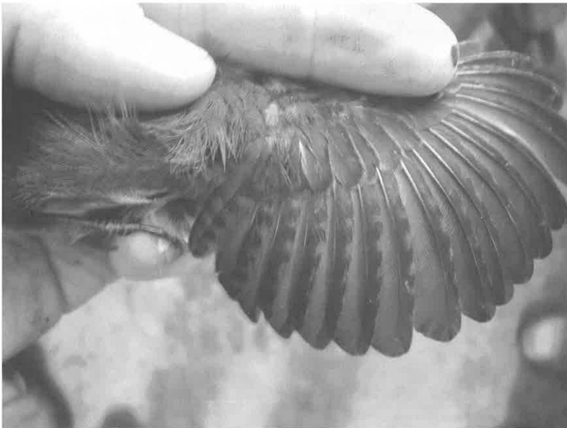
E) White-breasted Wood-Wren: molt limits within the greater coverts and between formative tertials and older secondaries.