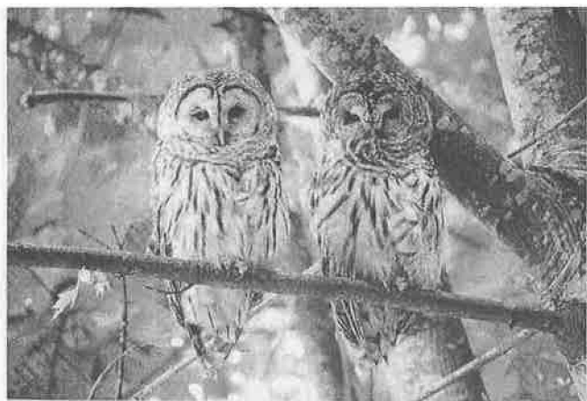
Fig. 1. Photo of tailless pair taken 24 Jun 2011; female on left.

For this pair, the period of time from loss of tail to a complete hardened set of rectrices was approximately 60 days. The average rectrices growth rate for the male, starting at the estimated date of loss, was 3.7 mm/day for the 60 day period.