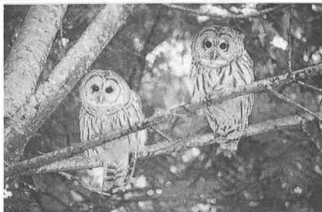
Fig. 2. Photo of pair taken 18 Jul 2011, prior to capture; female on left. Note more advanced molt of female.