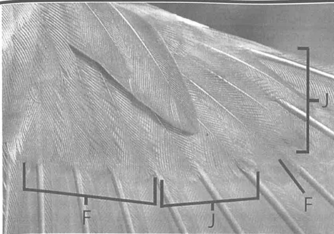
Fig. 1. Western Wood-Pewee captured in Lassen County, CA, May 2007. This formative-plumaged wood-pewee had formative and juvenile primary coverts. The retained juvenile primary coverts, denoted by 'J', (5-6 and 8-10) were more tapered, worn, brown, and less-densely barbed relative to formative primary coverts, denoted by 'F' (1-4 and 7), which were truncate, fresh, and steely gray.