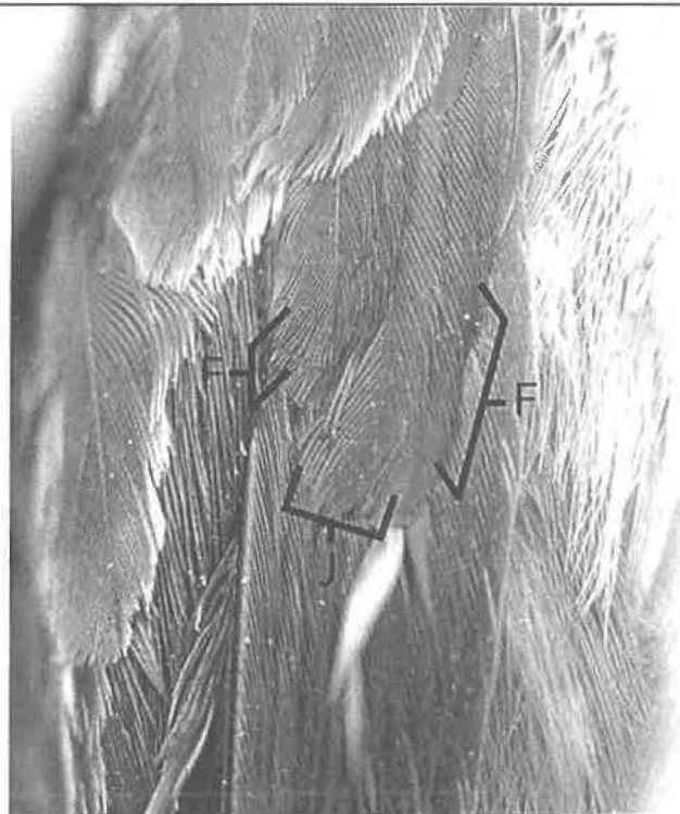
Fig. 2. Example Western Wood-Pewee specimen from northern California photographed at the Smithsonian National Museum of Natural History, Jan 2008. Photographing molt limits within the primary coverts of closed-wing specimens is inherently difficult. Similarly to wild wood-pewees captured in northern California (Fig. 1), this formative-plumaged wood-pewee specimen had mixed formative and juvenile primary coverts. The retained juvenile primary coverts, denoted by 'J' (central and obscured outer feathers), were more tapered, worn, brown and less-densely barbed relative to formative primary coverts, denoted by 'F' (apparently 1-3 and possibly 6-7), which were truncate, fresh, and steely gray.