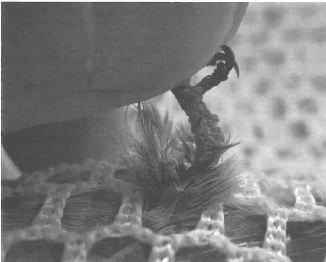
Fig. 4. Leg showing warty appearance of pox-like syndrome.

Female hummingbirds of most species construct a nest over a period of several days. They use plant down and spider webs, pushing nest material with breast and vigorously tamping down material inside the nest with feet (Calder and Calder 1992, Baltosser and Scott 1996, Robinson et al. 1996, Russell 1996, Powers and Wethington 1999). In species that double brood, including Anna's Hummingbirds, the females perform this process a second time, usually constructing a new nest at a different site (Russell 1996). Because nesting material can be deposited between the band and the leg in some individuals, the space between the band and the leg is diminished. Amat (1999) and Splittgerber and Clarke (2006) found accumulation of foreign material under leg bands resulted in injuries to banded legs in Bell miners ( Manorina melanophrys ) and Snowy Plovers ( Charadrius alexandrinus ).