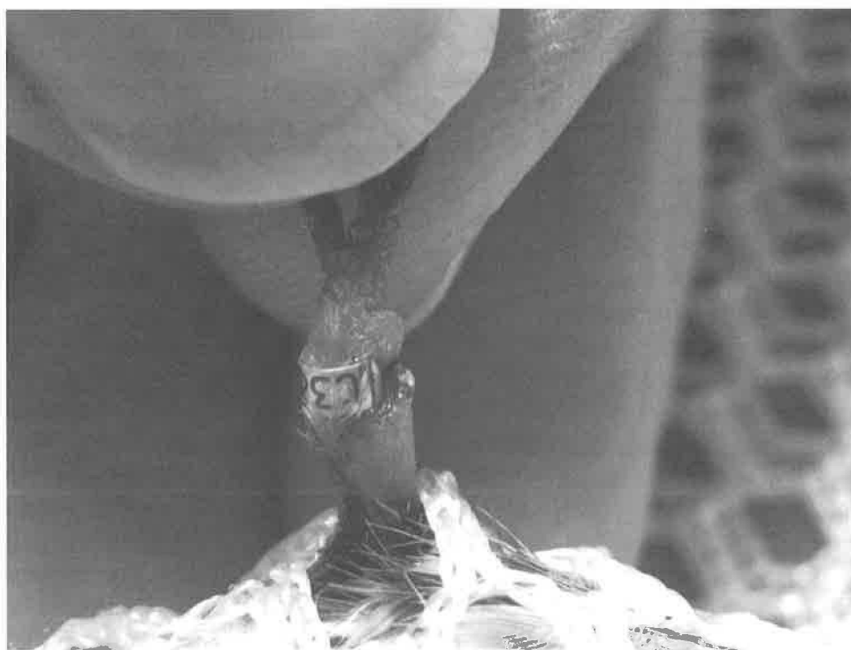
Fig. 1. Banded-leg injury showing inflamed, swollen leg.

We recaptured a total of 364 adult female Anna's Hummingbirds from previous years at the three sites; 41 of these females had injuries to their banded legs (Table 1). In comparing captures of females with