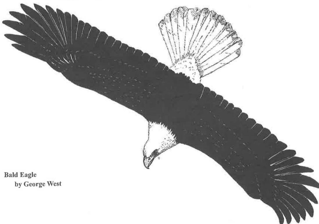
Bald Eagle by George West