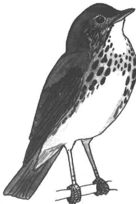
Hermit Thrush by George West