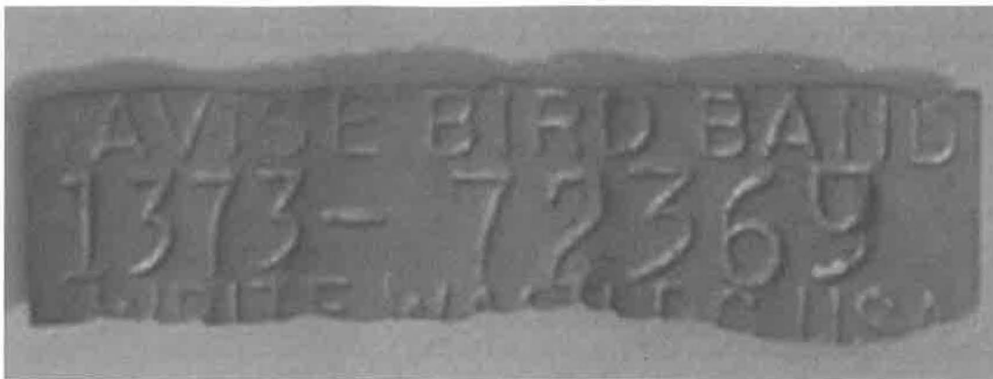
Fig. 1. Band recovered from Elegant Tern after 20 yr and 11 mo.

The oldest individual in this group was 20 yr 10 mo old when found. This is a new longevity record for the Elegant Tern. The oldest previously documented individual was banded on Isla Rasa, Mexico, on 24 Jun 1991 and found dead near Coronado, CA, on 2 Jun 2007 when 16 yr old (Lutmerding and Love 2010). This is < 9.25 km from the breeding colony of Elegant Terns in San Diego. Inter-annual movement of Elegant Terns among the southern California colonies is frequent (Collins 2006) but this is the first documentation of interchange of individuals between breeding colonies in Mexico and a southern California site during the breeding season.