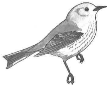
Yellow Warbler by George West