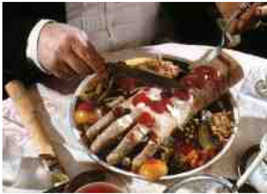
Figure 11: Jan Švankmajer, Dinner (severed hand)

The overindulgence of the dressing comes to an end when the man begins to eat the meal. He does this in a very unusual way by placing a fork in his hand, which is wooden; he then proceeds to hammer the fork into place with two nails and checks to see if the fork is sturdy. He picks up his knife and moves both of his hands over the plate in order to cut the food item on his plate; it is at this point that the food item, the man's hand and part of his arm, is finally revealed to the spectator (see Figure 11).