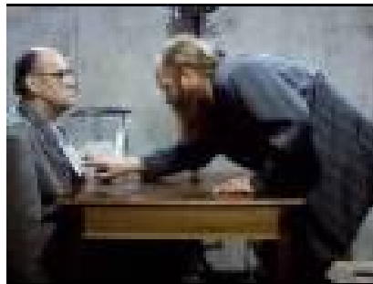
Figure 6: Jan Švankmajer, Breakfast (active and sitting man)

first segment, Breakfast . Next, a medium establishing shot of a man sitting in a sparsely furnished room sets the stage for the following interactions. A man enters the room and shuts the door behind him; both men are elderly and dressed alike in clothing that is sensible and unadorned. For the sake of clarity, the man who first appears in the shot will be referred to as “sitting man” and the man entering the room as the “active man” (see Figure 6).