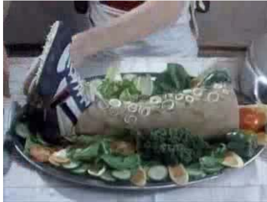
Figure 12: Jan Švankmajer, Dinner (severed leg and foot)

The man takes off the shoe with his fork and knife and proceeds to cut into the foot, but at this exact moment the camera quickly pans to another table into a close-up of two halves of a lemon. This is followed by a female picking up the lemons and squeezing their juice onto a pair of breasts that lay on a plate with garnish (see Figure 13). As she picks up her spoon and begins to eat, the camera pans to yet another table.