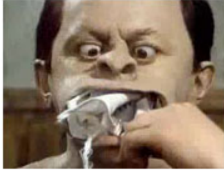
Figure 9: Jan Švankmajer, Lunch

Finally, the two men have devoured the table and chairs. They sit naked on the floor as the server walks past them and they fail in their final attempt to get his attention. At this point the older man takes a look at his cutlery and places it in his mouth as though he were consuming it. Just as before, the younger man does the same, only this time the older man has tricked the young man. The young man learns that the older man has not swallowed his cutlery when he proceeds to regurgitate it. The older man gives the younger man a look that implies a devious sense of victory and proceeds to back the young man against the wall in an effort to consume him. The young man has a look of terror on his face as he raises his hands in an effort to defend himself. In the last shot, the spectator sees is the older man coming closer with his cutlery until it fades to black.