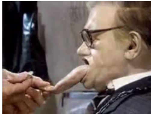
Figure 7: Jan Švankmajer, Breakfast (cow tongue)

Once the sitting man's mouth is open, the active man pulls up his sleeve and sticks his hand into the sitting man's mouth and pulls out his tongue. This act is a particularly grotesque representation of the mouth and head, because as the active man places his hand in the sitting man's head it deforms by getting larger and misshapen; in addition, the tongue is pulled very far from the mouth almost to the point of detachment (see Figure 7).