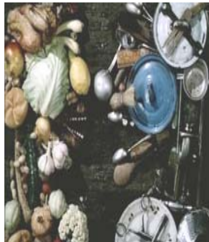
Figure 2: Jan Švankmajer, Exhaustive Discussion

This curious representation of the human head, with its emphasis on individual parts creating a whole, is, according to Bakhtin, one of the primary forms of the grotesque body: "Of all the features of the human face, the nose and mouth plays the most important part in the grotesque image of the body; the head, ears, and nose also acquire a grotesque character when they adopt the animal form or that of inanimate