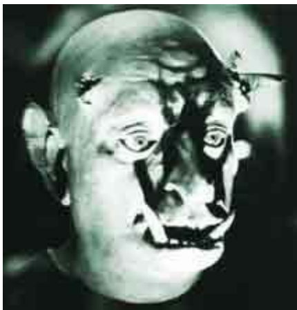
Figure 15: Jan Švankmajer, Faust Clay Head of Mephistopheles, Krátký Film, 1994

To illustrate exactly how the image of the grotesque body emphasizes the act of manipulation, it is necessary to closely analyze a scene in which this takes place, first focusing on the depiction of grotesque images of the body, then on the way in which it emphasizes acts of manipulation. The scene to be analyzed takes place late in the film and depicts Faust being manipulated away from contemplation and into physical pleasure by a demon. The scene begins with Faust inside of the theater in a backstage room; he encounters Mephistopheles in the form of a clay head. The head rolls in the direction of Faust in the form of a solid ball of clay, and as it slows to a stop it forms into a misshapen head with bulging eyes, oversized nose, large dirty teeth and horns. Here we can see that Bakhtin's description of the grotesque eyes, nose and mouth most certainly apply to Švankmajer's depiction of Mephistopheles (see Figure 15). The eyes are bulging, the nose protrudes from the face and the mouth is oversized and misshapen (Bakhtin 317).