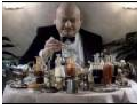
Figure 10: Jan Švankmajer, Dinner

The final segment, Dinner , begins with the same rapid succession of shots depicting cooked meals; this is followed by a medium establishing shot of an elderly gentleman sitting at a dining table. He is dressed in a tuxedo and the décor of the dining room is of fine quality as well. The table is crowded with various assortments of sauces and relishes (see Figure 10).