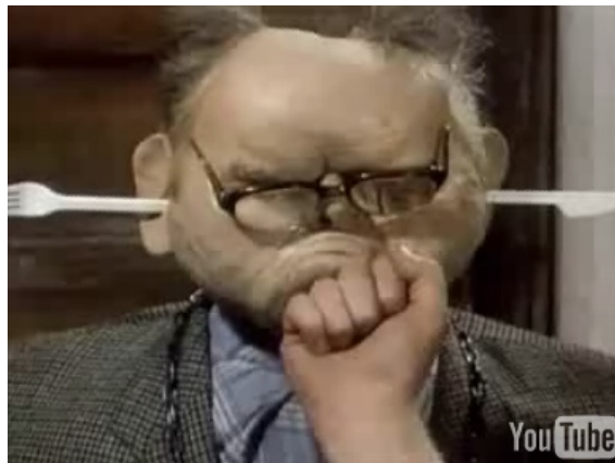
Figure 8: Jan Švankmajer, Breakfast (utensil dispenser)

Change is placed on the sitting man's tongue and it slides back into the sitting man's head. The active man then hits the sitting man on the head in an effort to push the change into the sitting man, as though he were a vending machine. The active man reads the instructions again and proceeds to lift the sitting man's glasses from his eyes, opening one of his eyes, and pushing his finger into it. At this point the sitting man begins to shake, the sound of rattling change is heard. The clothes on his chest begin to open; this reveals a cavity that resembles a dumb waiter. The pulley slowly pulls up a metal bin with a paper tray on it. The tray has one cooked sausage, some mustard and a small piece of bread on it; next to the tray there is a paper cup filled with beer. The active man proceeds to read the instructions again and punches the sitting man in the jaw, thus facilitating the projection of plastic ware from the sitting man's ears (see Figure 8).