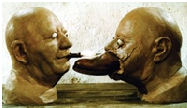
Figure 5: Jan Švankmajer, Factual Dialogue

In the segment titled Factual Dialogue the spectator is presented with an opening medium shot of a small wooden table with a drawer. The drawer opens and out of it comes a medium sized lump of clay. The clay lump climbs onto the table and separates into two heads; each head is similar in that it is gendered as male, bald and has bulging eyes that are made of fiberglass to appear realistic. Once the heads are situated on the table, each mouth opens and an object comes out. This repeats in a series of semi rapid shots; in the first series of shots the items that protrude from the mouth match one another in their use. For example, the first set of objects is a toothbrush and toothpaste, the second a piece of bread and butter, third a shoe and its laces, and the final a pencil and a sharpener. In this series of shots the two objects interact according to their proper use, such as butter spread onto bread and toothpaste onto the toothbrush. Once each set of objects has interacted, the heads switch places on the table and another series of semi rapid shots begins, this time the objects interact with each other in a mismatched way. For example, the bread receives a pair of shoelaces; the butter is spread onto the pencil, and the shoelace is put into the sharpener (see Figure 5).