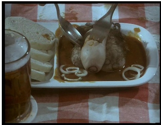
Figure 14: Jan Švankmajer, Dinner (severed penis)

spoon, both of which are made of flimsy metal; in this shot the spectator can see that the table is no longer covered with fine linen, but a dirty red checker table cloth covered with ashtrays and ashes. The following shot shows his fork and spoon cutting into a penis that lies on a white plate (see Figure 14); it is surrounded by a red sauce and onions with a side of bread. The man quickly places his hands atop the penis to hide them from the spectator, he then shoos the spectator away with one hand as the shot fades to black.