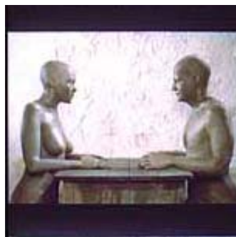
Figure 3: Jan Švankmajer, Passionate Discourse

The segment titled Passionate Discourse begins with a medium shot of two realistic full body clay figures sitting at a table, one male, and one female. As seen in Figure 3, neither figure has hair and both are undressed. After a close-up of the male's smiling mouth and the female's eyes slowly blinking and her head nodding in acceptance, the two figures touch hand to hand and engage in a kiss. At this point their heads begin to meld together and shot by shot the viewer watches the bodies blend together at each touch and embrace until the bodies have come together in a symbolic act of lovemaking. Just as Bakhtin described the "old bodily canon" in which the body is depicted as being free of bodily limitations, the two bodies are free in their interactions, without regard to the constraints of society (Bakhtin 318).