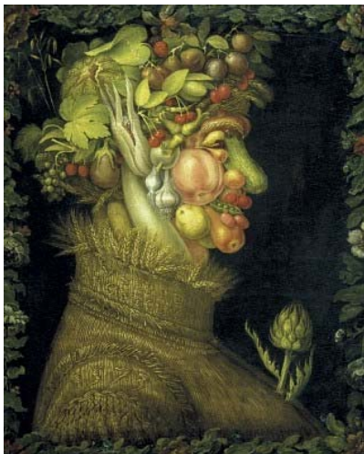
Figure 1: Giuseppe Arcimboldo, Summer

In the first segment, Exhaustive Discussion , the spectator is presented with three heads that repeatedly consume one another in a most destructive manner. The material make-up of these heads takes on a style similar to that of Giuseppe Arcimboldo's mannerist paintings, mainly in their individual inanimate parts, such as food or manmade utensils creating a whole which is the head (see Figures 1 and 2).