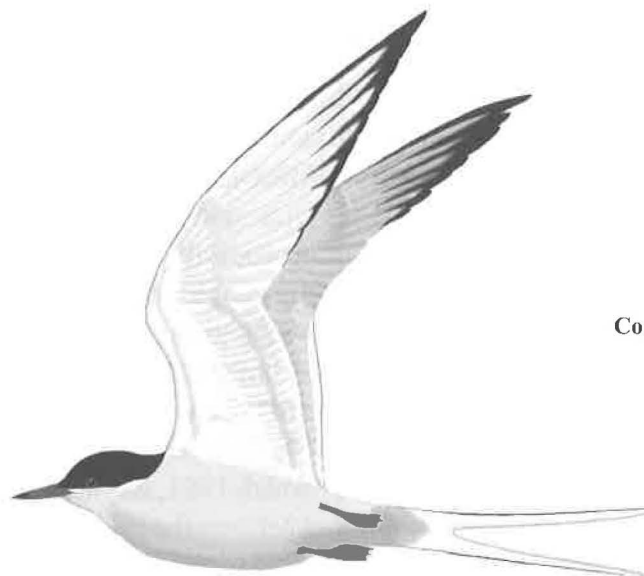
Common Tern