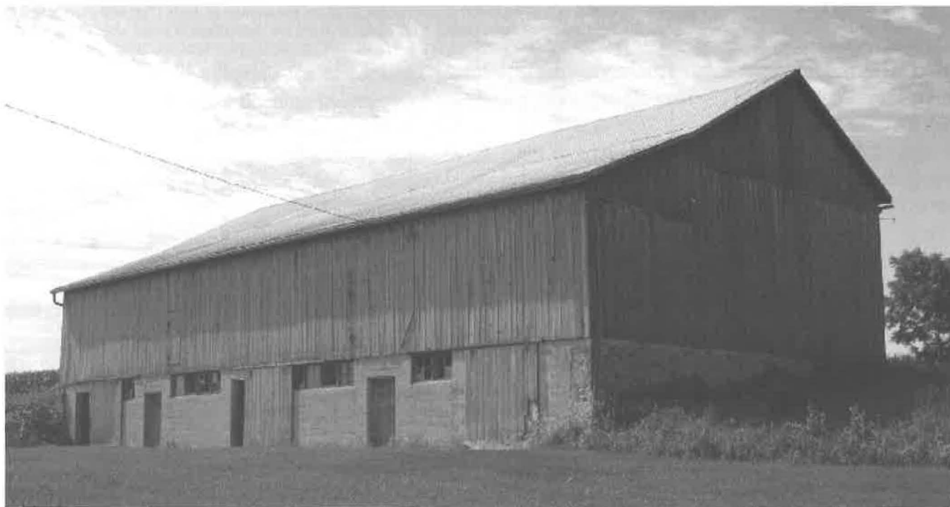
Fig. 1. Typical Barn Swallow nesting location (site #2).

Birds build their mud nests, lined with feathers and animal hair, either fastened to a vertical wall or wooden beam beside the juncture with the ceiling (>95%) or on top of a horizontal board (<5%). If the nests are not destroyed, the birds use existing nests (99%) from year to year, with only a small number (<1%) of new nests being built in any given year.