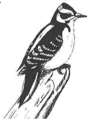
Hairy Woodpecker by George West

Thanks very much to all the banding stations who take time out of their busy schedules to submit these reports.