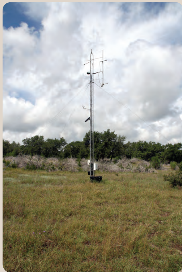
Figure 1. Evapotranspiration station in the treatment watershed at site TWS ET (U.S. Geological Survey station 295102098283200 Honey Creek treatment evapotranspiration near Spring Branch, Texas), Honey Creek State Natural Area, Comal County, Tex., July 23, 2010.

The U.S. Geological Survey (USGS), in cooperation with Federal, State, and local partners, examined the hydrologic effects of brush management in two adjacent watersheds (figs. 1 and 2). Hydrologic data were collected in the watersheds for 3–4 years (pre-treatment) depending on the type of data, after which brush management occurred on one watershed (treatment watershed) and the other was left in its original condition (reference watershed). Hydrologic data were collected in the study area for another 6 years (post-treatment). These hydrologic data included rainfall, streamflow (fig. 3), evapotranspiration (fig. 1), and water quality. Groundwater recharge was not directly measured, but potential groundwater recharge was calculated by using a simplified mass balance approach.