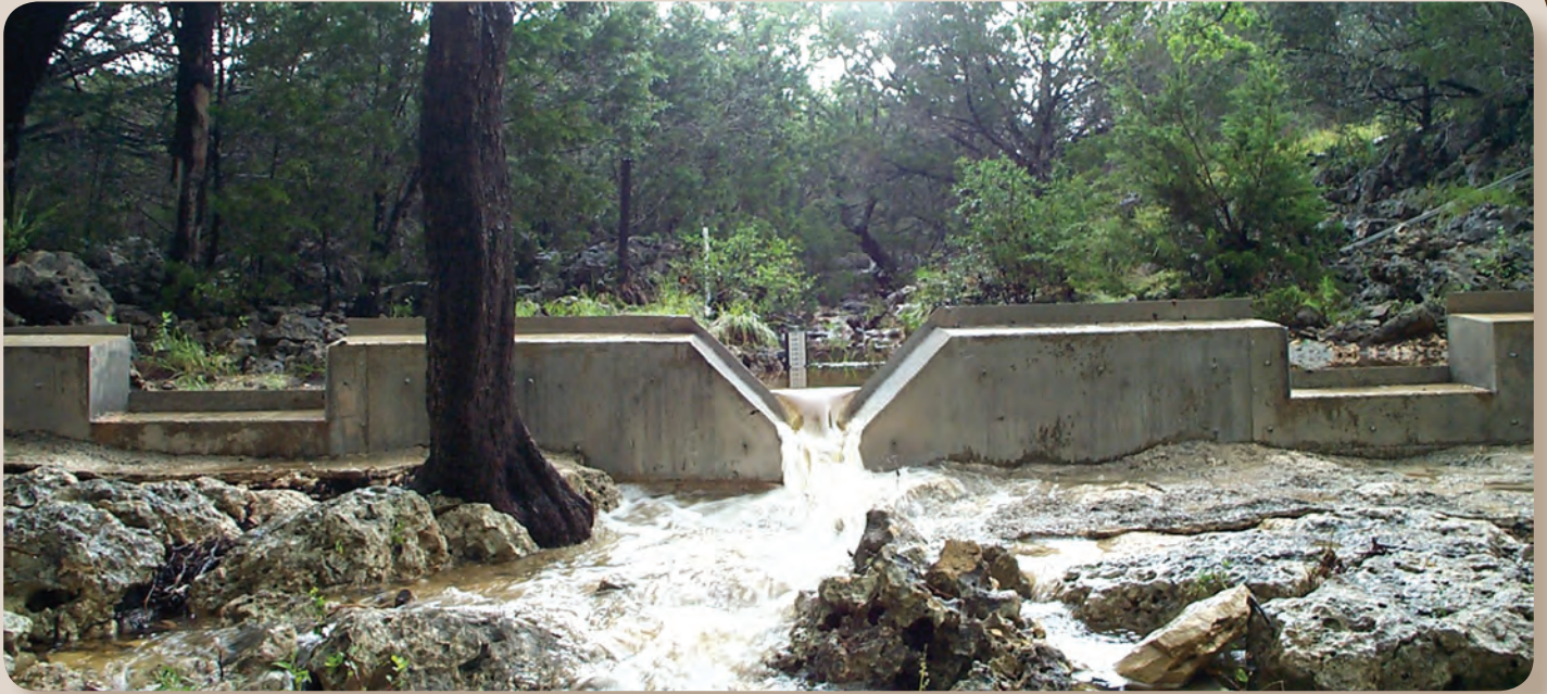
Figure 3. Streamflow-gaging stations were installed in the study area, such as this weir in the treatment watershed at site 2T (U.S. Geological Survey station 08167353 Unnamed tributary of Honey Creek site 2T near Spring Branch, Texas), Honey Creek State Natural Area, Comal County, Tex.

The following highlights of the study are summarized from the USGS Scientific Investigations Report (Banta and Slattery, 2011) on which this fact sheet is based: