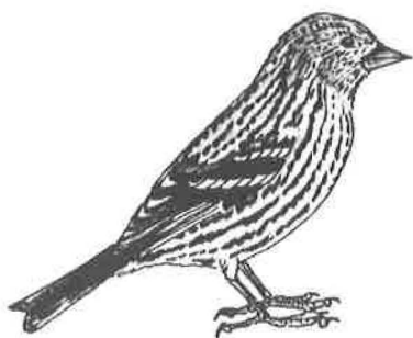
Pine Siskin by George West

For Pine Siskins, 362 of the 833 birds in the dataset could be paired with at least one other bird consistent with flock fidelity (both banded at the same station and then both re-encountered at a second banding station after the last banding date). Table 2 provides a summary of the data. The strongest data come from the first line of data in the table, where 275 pairs were banded within a week of each other at the same station and re-encountered at a distant station within a week of each other. The strongest data are the 22 pairs re-encountered at a distance in excess of 100 km from the banding site. These birds included four individuals (combined into six pairs) that were banded 18-23 Feb were re-encountered at a station 144 km away on 25-26 Feb. Five individuals (combined into 10 pairs) banded on 21-22 Dec were re-encountered 188 km away on 17-18 Apr. A pair banded on 4 Apr and re-encountered 482 km away on 18 Apr and 27 Apr, respectively, provides another example. This last example may have been a mated pair but gender was not reported for either bird.