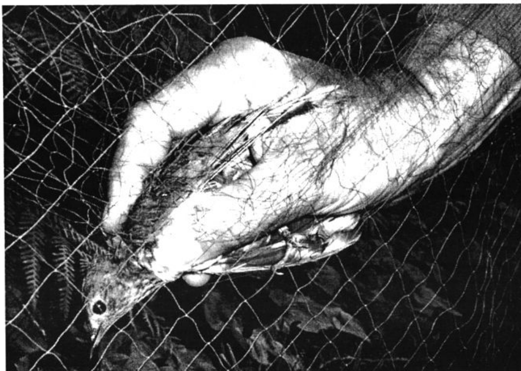
Fig. B. The fingers in a direct approach moving the bird into the “bander’s grip.”

forward, towards the front of the bird. The fingers should move through the body feathers and then around and over the curve of the body, making sure there are no net threads under the fingers. Once the fingers have firmly (and gently) encircled the body with the fingers touching the body, and with the net and wings outside of the fingers, the bander begins to back the bird out and away from the net to expose one wing. If there is resistance from the strands, one wing usually can be freed by gently flicking the netting from the underside of the wing, up over its bend. At this point the bird is usually completely free on one side and can be rotated or slid into the bander’s grip if the bander wishes. Since the neck usually will still be entangled, the fore and middle fingers should be kept somewhat to the rear of the neck so that the fingers remain between the body and the net strands. Then the bird should be lifted farther out of the net pocket and away from the net (Fig. C) in order to free the other wing and the head (Fig. D) and finally the legs and feet.