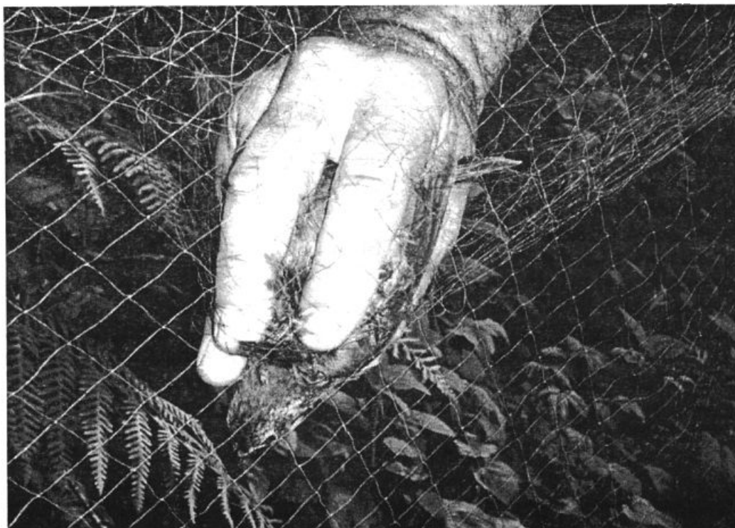
Fig. A. A bird lying belly down in the net and the fingers sliding down the body to begin to encircle it.

Determine how entered. —First, as in any extraction method, the bird has to come out the same way it went in, so it is critical to identify correctly the entry route. As with other methods, to do this the bander carefully parts the folds of the tier of net above the bird, and looks into the pocket formed as the bird hit the net. If the opened pocket does not reveal a clear view of the bird, pulling some threads on the lower tiers of net, while holding the bird's tier taut, may clarify the situation, and may even free the bird of some threads. When the bander can see some part of the bird without net in the way, then the entrance has been found, and thus the exit for extraction. (Often, the motion of parting the netting away from the bird frees it partially or completely of entanglement. Swift and sure control of the bird at this moment is necessary to prevent re-entanglement.) Then the bander should determine if either the 'direct' or 'side' approach should be used, as detailed below.