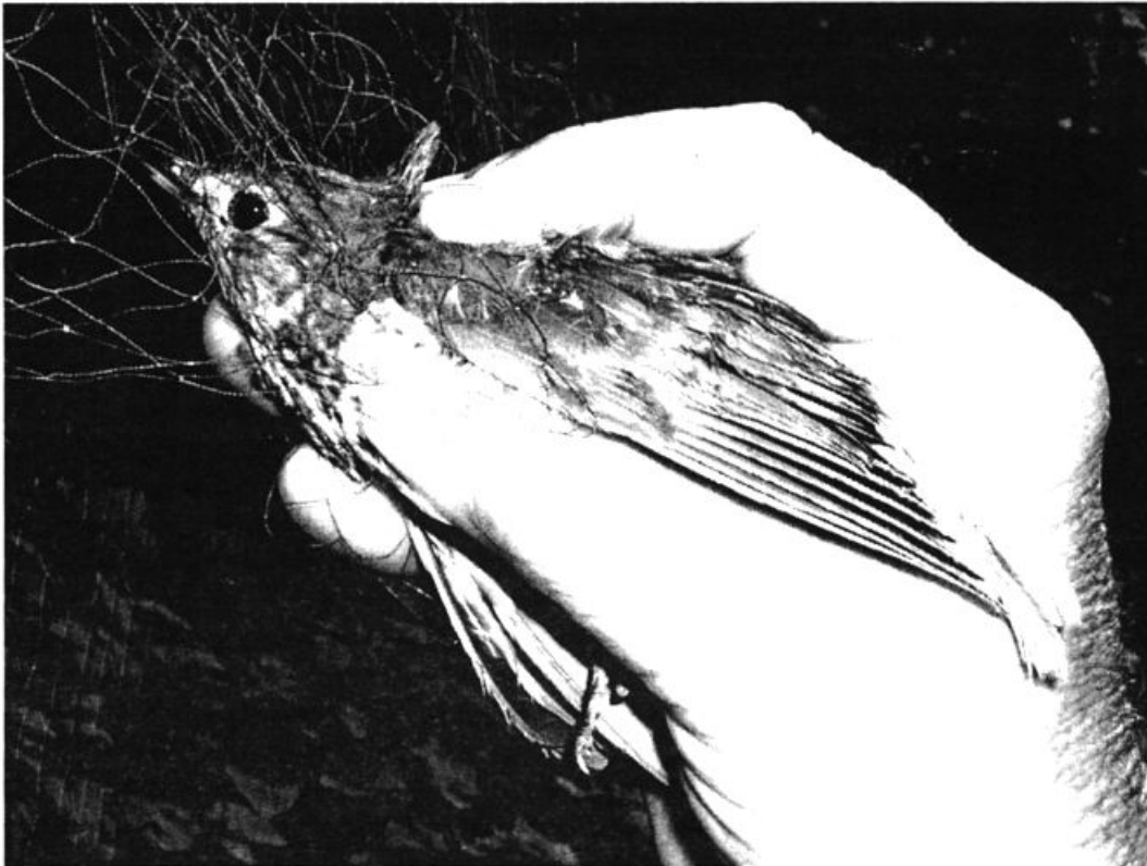
Fig. C. The bird being backed out of the net. Note that the thumb is under the wing, so that the net can still be pulled off.