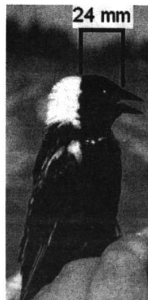
Fig. 1. Profile of an alternate plumaged male Bobolink in-hand, with measurement between posterior edge of the exposed culmen and anterior edge of nuchal collar (nape) indicated. The photo demonstrates why the nape was not measured directly, as with head upright (shown) it might vary little, but with bill-under-thumb could conceivably vary widely due to stretching.

posterior edge of the exposed culmen and the anterior edge of the nape patch (Figure 1). This distance (hereafter called "nape-to-culmen distance") was used because the absolute length of the nape patch varies widely due to position of the head and neck, becoming broader as the bill is moved downward (e.g., as if the bird were to be 'skulled'). By contrast, the distance between culmen and nape varies little. Numerous recaptures within a season showed that nape-to-culmen distance suffered little inter-observer measurement error and did not change over the course of the season.