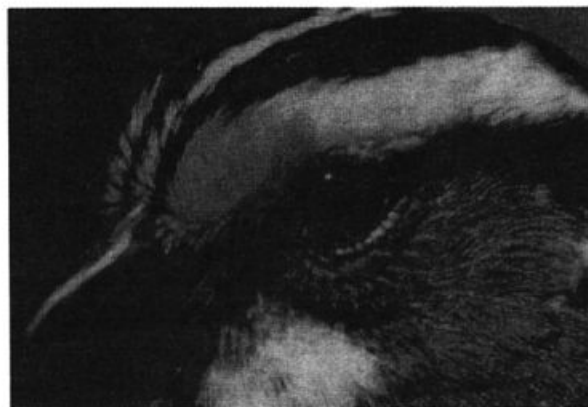
White-throated Sparrow

Mark Hauber - How brood parasites learn to recognize their own species for reproductive success