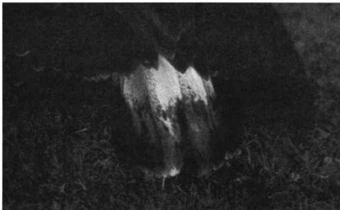
Photos 5 and 6. Tail of juvenile Golden Eagle from central Montana. This is the same individual as in Photo 1.