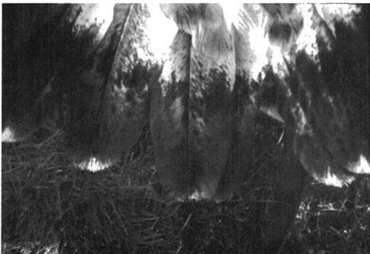
Photo 6. Under surface. 3 Aug 1973 (about one month after fledging).