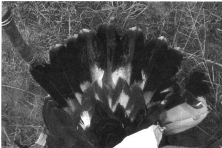
Photo 4. Pale mottling in the tail of a juvenile Golden Eagle (about one week after fledging, central Montana, 8 Jul 1972).