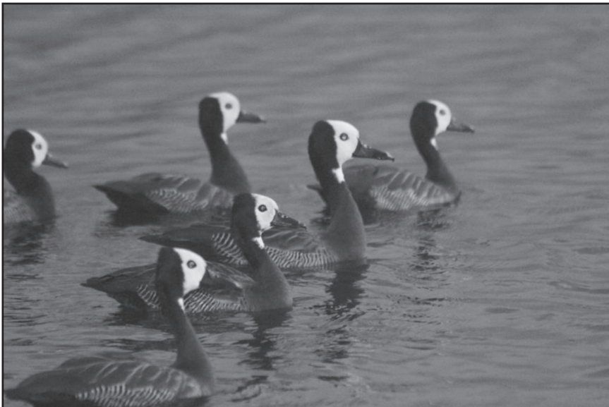
Figure 1. Flock of six White-faced Whistling-Ducks at the capture site prior to any capture attempts.

There have been multiple reports of White-faced Whistling-Ducks ( Dendrocygna viduata ) in Florida since the first in 1991 (Sullivan et al. 2009, Greenlaw et al. 2014, EDDMapS 2018). The sighted birds were most likely released or escaped from captivity, but some may have possibly been natural vagrants (Greenlaw et al. 2014). In November 2015, we learned of a flock of six White-faced Whistling-Ducks in Davie, Broward County, Florida (Fig. 1). In June 2016, we captured,