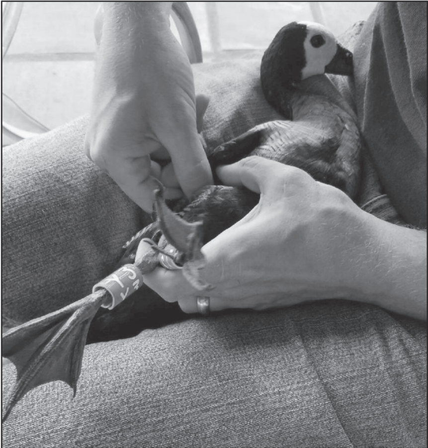
Figure 2. Color marking an after-hatch-year female with marker “Y3”.

The range of White-faced Whistling-Ducks is from Costa Rica to northern Argentina and Uruguay, including Trinidad, and sub-Saharan Africa, including Madagascar and Comoro Island (del Hoyo et al. 1992, Dickinson et al. 2004). White-faced Whistling-Ducks were listed by Robertson and Woolfenden (1992) as “unestablished exotics” in Florida, with only one report. Greenlaw et al. (2014) list the species as “verifiable, potential natural vagrants” and include 10 reports (five