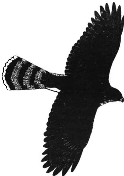
Cooper's Hawk