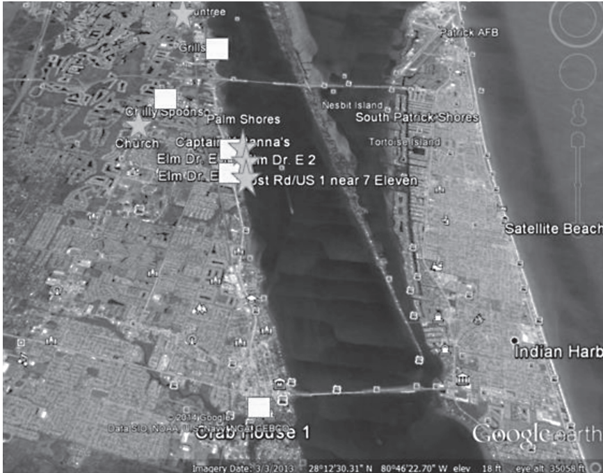
Figure 1. Osprey nest sites on the Indian River Lagoon, Brevard County, Florida, January – May 2014. The squares show the nests on artificial substrates, and the stars show the nests on natural substrates.

alert posture. As in Bretagnolle and Thibault (1993), Ospreys sitting in the nest were considered to be resting; while a more vertical posture of the bird (standing on the edge of the nest) was considered to be Vigilant.