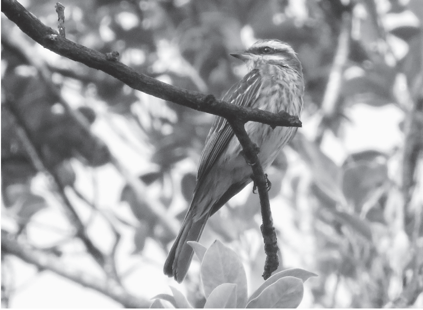
Figure 2. Florida's second vagrant of E. varius (Broward County, 2015; FOSRC accepted, August 2016) perched in typical "sit-and-wait" fashion on a branch in a large fig ( Ficus aureus ) under layer of canopy foliage in semiopen upper crown. Perches offered vistas of leaf undersurfaces, which were watched for stationary prey. Captures were by sallies to foliage.

the movements of any passerine during a hawking maneuver based on an analysis of a taped record. Apart from the "sit-and-wait" (Huey and Pianka 1981) scanning session (at least 25 sec) before the launch, the sallying maneuver examined here was documented in full from its initiation on a powerline to capture of an insect. The perched, watchful phase involved abrupt, short rotations of the head, each alternating with a brief pause and rapid peering in its facing direction. Mostly the bird scanned to the front and sides to about 90°, but occasionally it turned its head to peer over its shoulder to the rear. The entire hawking maneuver from launch to capture lasted about two seconds, so the insect was fairly close to the bird. The small insect was visible on the tape and appeared to be heavy-bodied and short-winged. Earlier, a similar type of insect flew quickly on a parabolic course close over the perched bird's head, but the flycatcher appeared to ignore it or perhaps did not notice it.