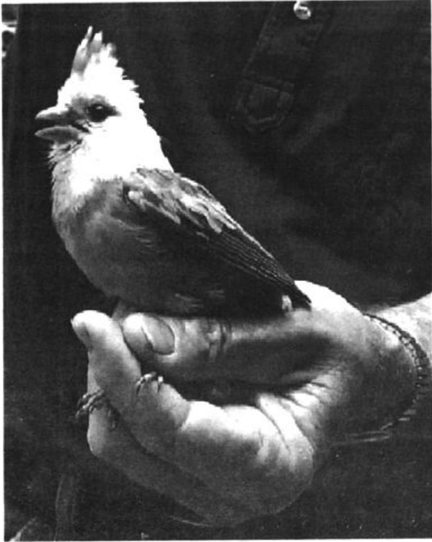
Fig. 1. Female Northern Cardinal after spontaneously turning schizochroic. The underside of the bird has retained the normal brown coloration, whereas many of the wing coverts are rose-colored because melanin is absent. (I thank Dr. P. Rutkovsky for taking the photograph when I captured the bird on 18 Mar 2000.)

The bird appeared to be perfectly fit, as it not only survived but attracted a mate: When I caught the bird in spring 2000, I noticed a brood patch, and I discovered her nest in July, which fell victim to predation after the young had hatched. In March 2001, I observed the abnormally plumaged female in the company of a male; and when I captured her on 13 Apr 2002, she again had a brood patch. Indeed, on 20 May 2002, I discovered her on her nest, apparently incubating, but four days later the very conspicuously located nest was deserted and empty. This was my last record because I did not encounter the bird again.