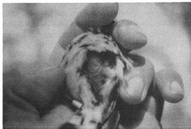
Fig. 1. Underside of Magnolia Warbler #1890-65086 showing a vascularized brood patch and bold streaking of the underparts, 11 Jun 2000.