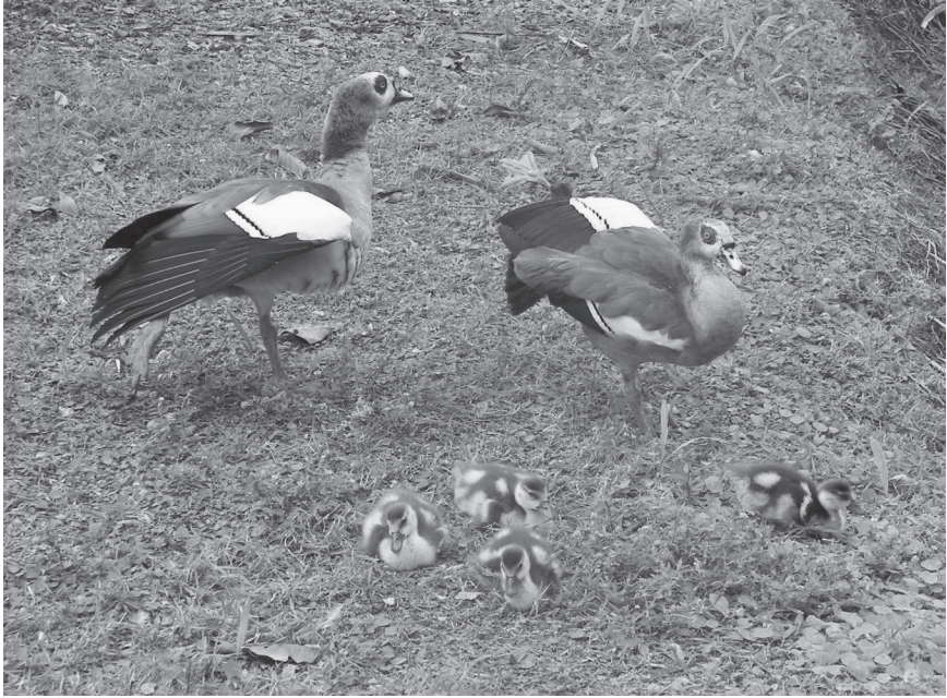
Figure 1. Egyptian Goose pair with brood of four goslings. Crandon Park, Miami-Dade County, 10 February 2008.

the ground, in burrows, on cliffs, or in trees, sometimes in used nests of other birds (Todd 1979). Clutches contain 6–12 (average 7) eggs that are incubated by the female for 28–30 days (Todd 1979, Tattan 2004). Both sexes aggressively defend the nest and young. Goslings leave the nest shortly after hatching and fledge after 70 days (Tattan 2004). Sexes are indistinguishable by plumage but females are smaller than males. Juveniles resemble adults but have duller plumage that lacks the dark brown breast spot and eye patches (Mullarney et al. 1999). Egyptian Geese are primarily herbivores, grazing on grasslands at times considerable distances from water. They also feed on aquatic vegetation and animal prey such as worms, insects, and frogs (Tattan 2004).