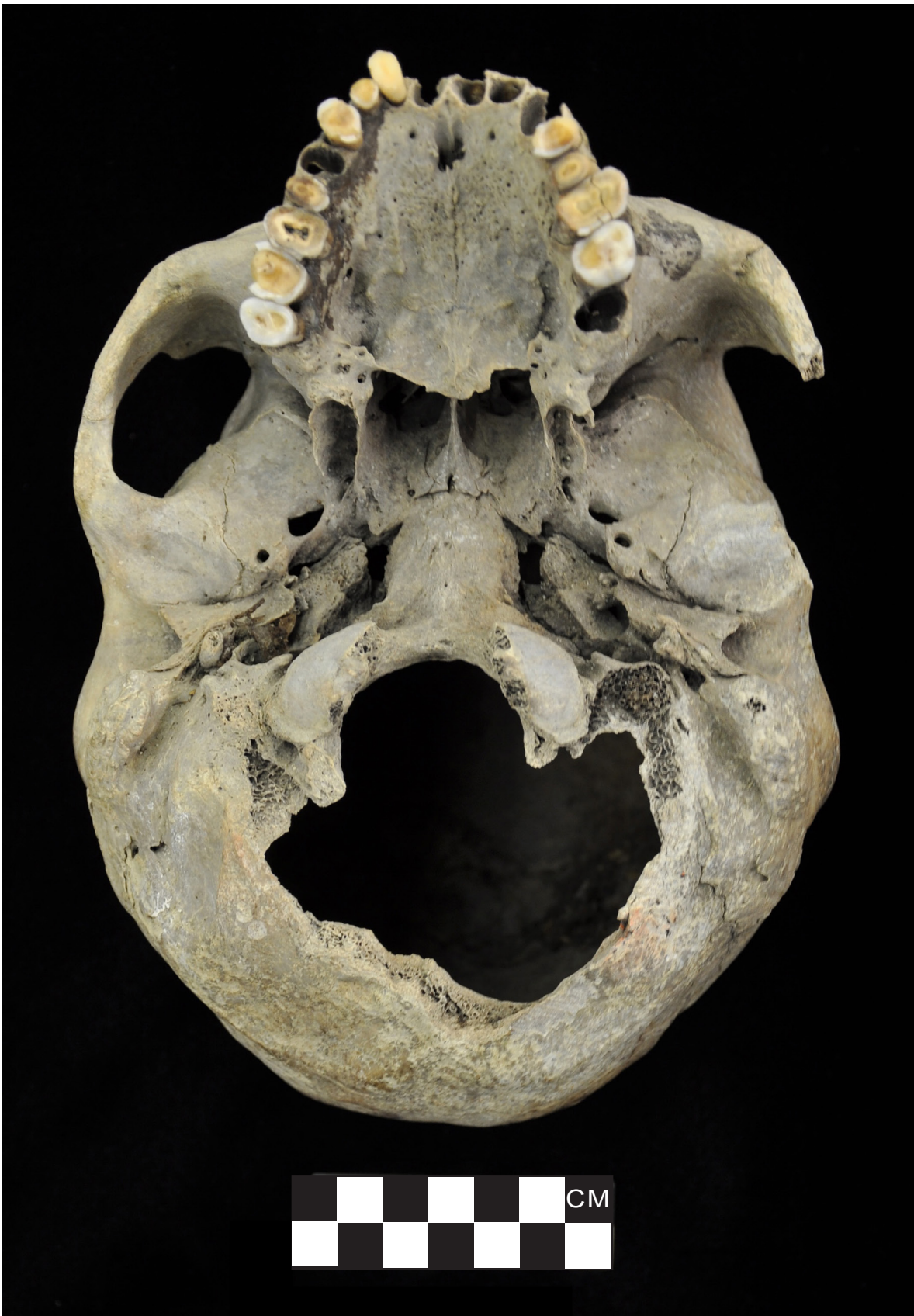
Figure 6. Inferior view of C2.