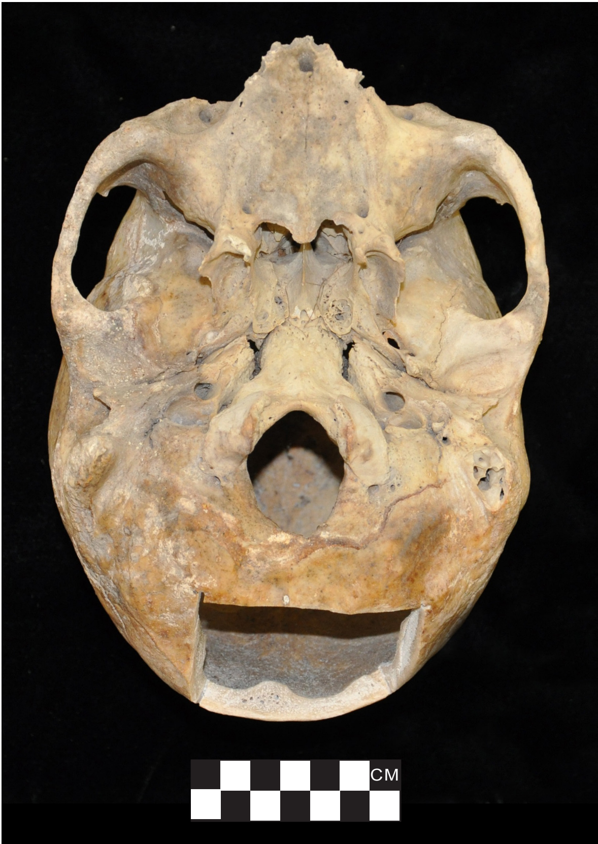
Figure 4. Inferior view of C1. Note the rectangular section of the occipital that was removed for radiocarbon dating.