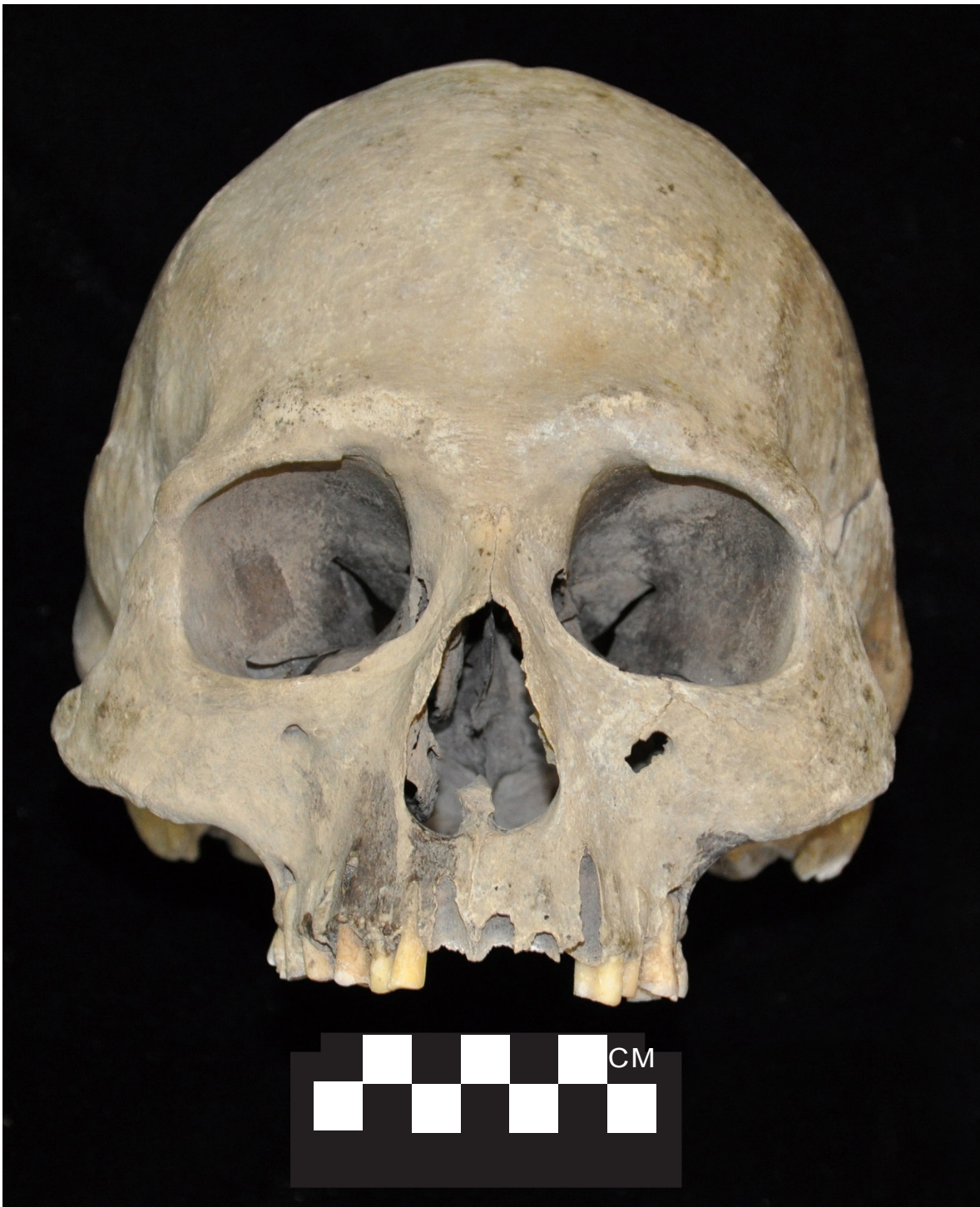
Figure 5. Anterior view of C2.