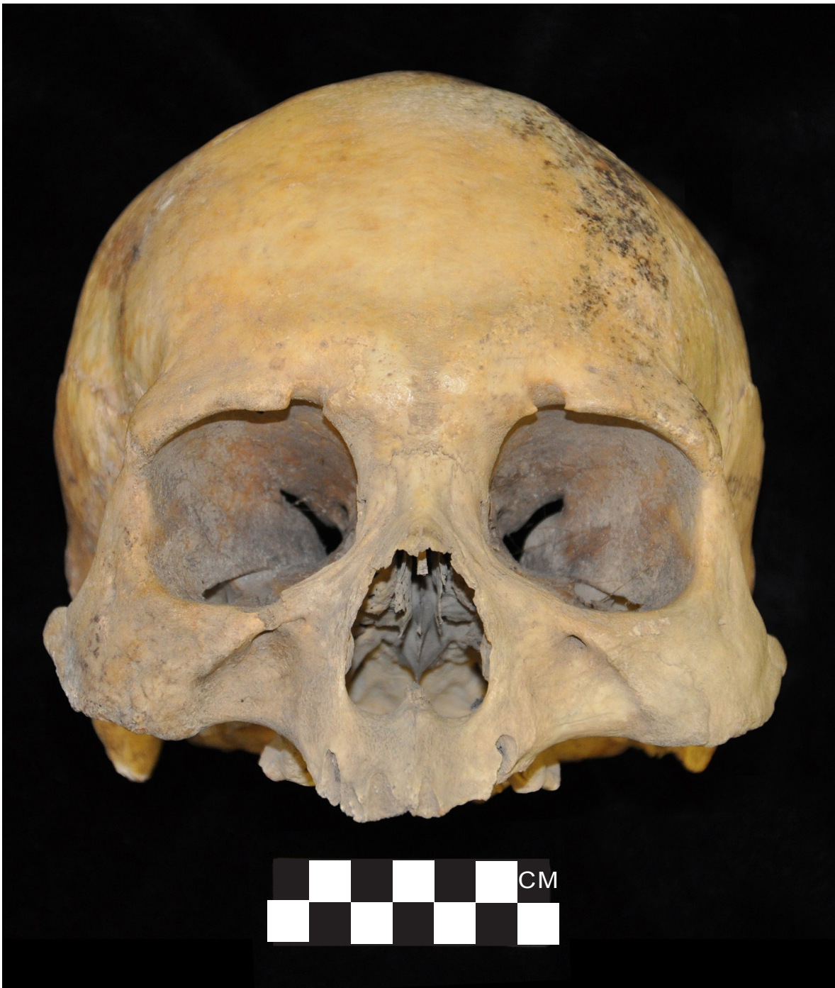
Figure 3. Anterior view of C1.