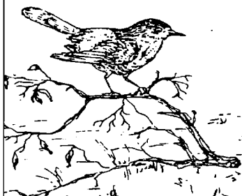
Illustration from the book.

456 illustrations • $32.50 paper At bookstores, or call (607) 277-2211